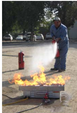
Shafter Fire Training

EH&S Office staff have continued to provide training at ANR facilities and offices, including respirator fit testing and training and presentations on safety responsibilities, injury illness prevention program (IIPP), building evacuation, driver safety, use of fire extinguishers, safe lifting practices, workstation ergonomics, and hazard communication. More than 442 persons were trained by ANR EH&S staff this year, including REC employees, UC departmental staff and students, USDA personnel, 4-H and Master Gardener volunteers, and CE employees. Review of written evaluations of EH&S training and presentations indicated attendees have an overall favorable approval rating of 100%.