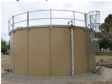
Desert REC Drinking Water Storage Tank

In support of Desert REC, EH&S staff secured regulatory approval for the replacement of outdated components of the drinking water system. A new above-ground drinking water storage tank has been installed as shown in the above picture and a new pre-filter is scheduled for installation during the current fiscal year. In addition, the poorly