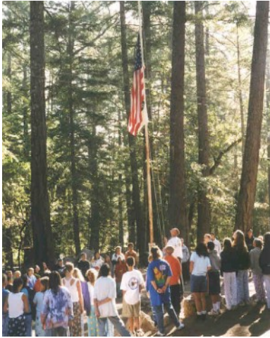
4-H Summer Camp Flag Ceremony

Safety materials included the development of an additional 18 "Clover Safe" notes and 15 attendant activity sheets. A total of 82 Clover Safe notes and 66 activity sheets are now posted on the EH&S web site. A series of 82 Newsletter Items have been developed for use by 4-H Program Representatives.