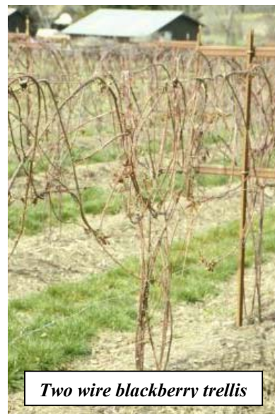
Two wire blackberry trellis

A three wire trellis system is adequate with the top wire at approximately 6 feet (1.8 m), the middle wire approximately 4 feet (1.2 m), and the bottom wire at approximately 2 ft. (0.6 m) from the ground. Some growers use a two wire system spacing the wires at 3.5 ft. (1.07 m) and 5 ft. (1.53 m) from the ground.