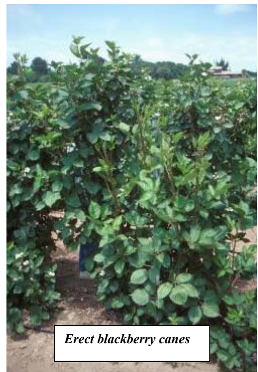
Erect blackberry canes

Darrow: Vigorous, hardy, large thorns, productive over a long harvest season with large glossy fruit.