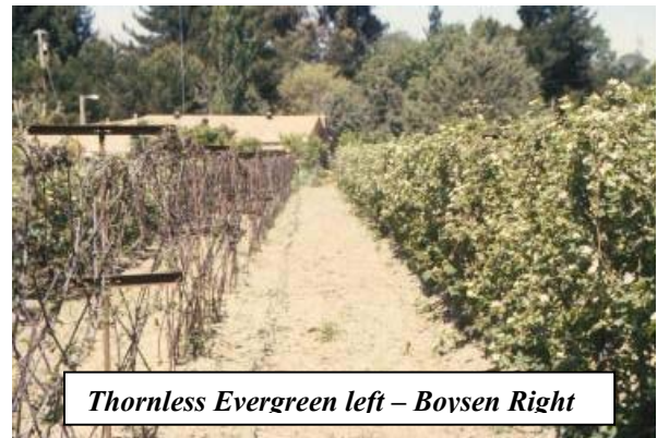
Thornless Evergreen left – Boysen Right

The two basic types of blackberries: are erect and trailing. Erect blackberries have stiff, arching canes that are somewhat self-supporting. Trailing blackberries have canes that are not self-supporting. On the East Coast, trailing blackberries are also known as dewberries. Blackberry plants live for many years; however, the canes grow one season (primocanes), produce fruit the second season (floricanes), and then die. Berries are borne on short lateral shoots produced on the floricanes. Listed below are important erect and trailing blackberry cultivars in California and their fruiting characteristics.