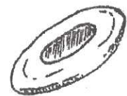
silt (Frisbee size)