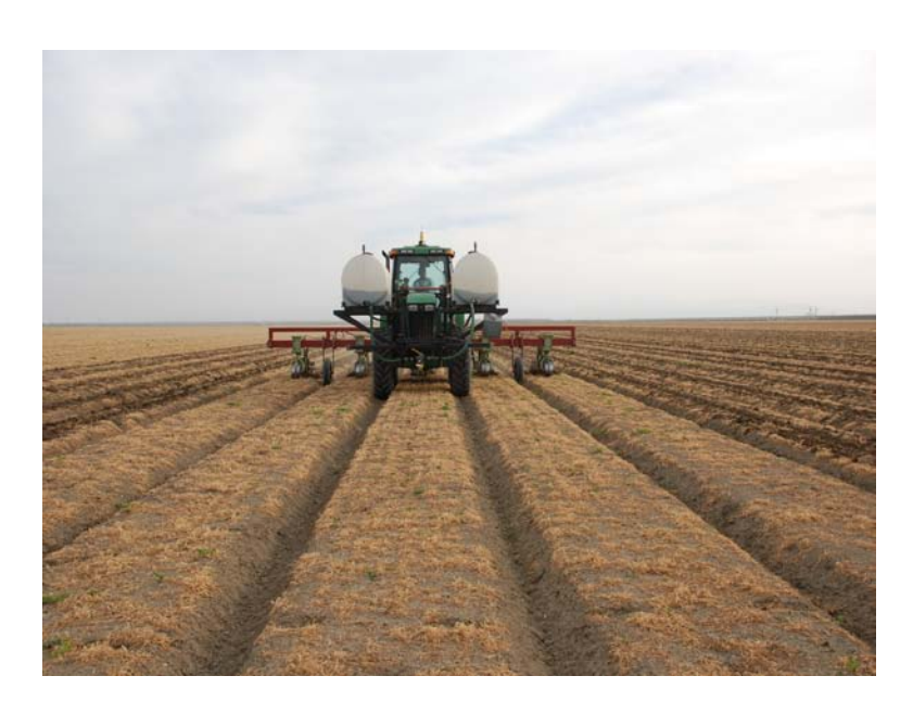
Photo 7. Modified Orthman 1-tRiPr 5-row striptill implement tilling in cover crop residue and incorporating preplant herbicide prior to tomato transplanting at Sano Farm, Firebaugh, CA, 2009