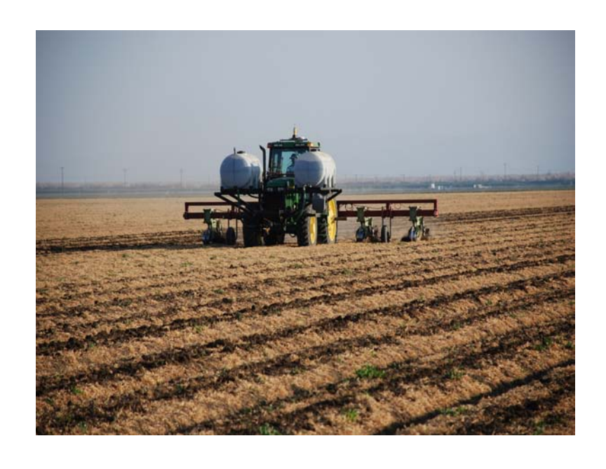
Photo 8. Ground-driven striptiller used to prepare bed centers prior to transplanting, Sano Farm, Firebaugh, CA, 2009