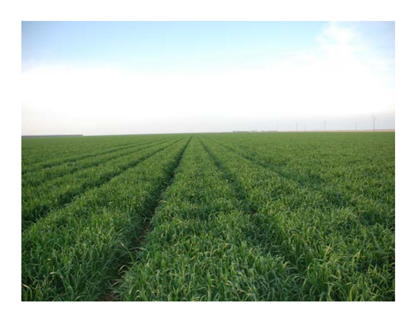
Photo 3. Winter triticale cover crop growth in early February 2008 at Sano Farm, Firebaugh, CA

more than about 15" tall, which usually is in early February (Photos 3, 4 and 5). The cover crop provides some winter weed control. They observe their cover crop combined with the overall conservation tillage approach that is used at Sano Farm results in lower weed populations in the tomato season.