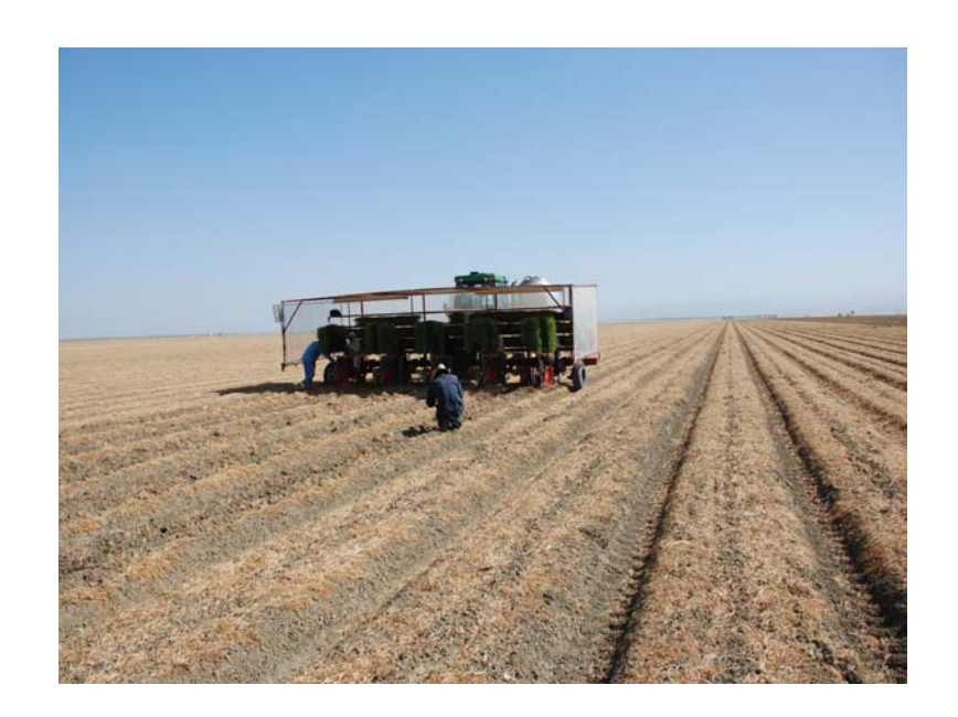
Photo 11. Conventional 5-row tomato Checcli Magli® (Hahn Tractor, Stockton, CA) transplanter that is used to establish tomato seedlings in cover crop residues at Sano Farm, Firebaugh, CA 2009

While changes in soil carbon have not been monitored at Sano Farm, based on recent long-term research with conservation tillage and cover crops a the University of California West Side Research and Extension Center in Five Points, CA, it is reasonable to expect that soil carbon levels have increased due to the cover crop inputs at Sano Farm.