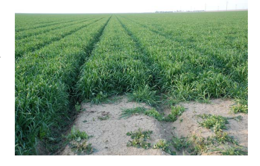
Photo 4. Triticale cover crop prior to herbicide termination at Sano Farm, Firebaugh, CA, 2008. This photo shows the height or extent of cover crop biomass achieved at the time of termination.