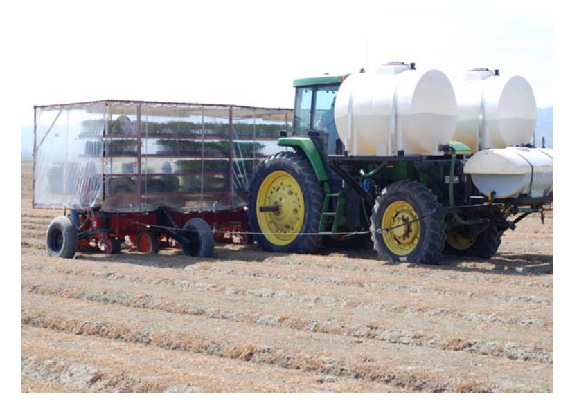
Photo 12. Conventional 5row tomato transplanter that is used at Sano Farm, Firebaugh, CA, 2009