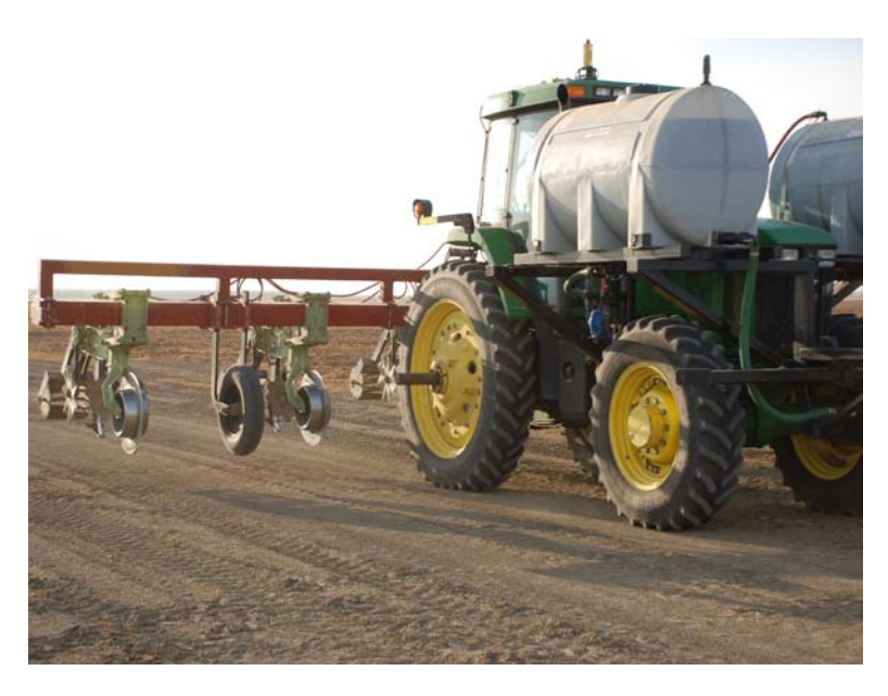
Photo 9. Close-up view of modified Orthman 1-tRiPr strip-till row units on Sano Farm strip-tiller showing residue-cutting depth wheel and coulter, subsoiling shank, wavy coulters, and clod-busting rolling baskets.