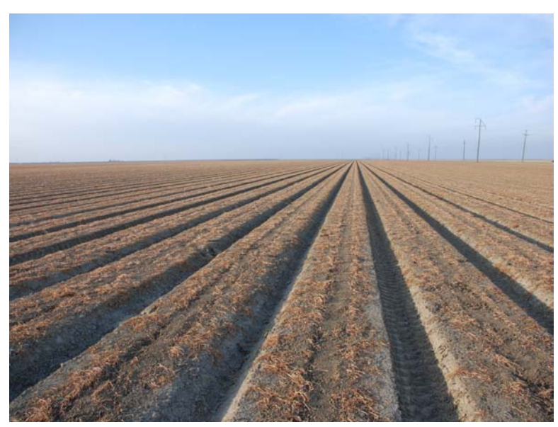
Photo 10. 60 inch tomato beds after herbicide burn down of cover crop and bed-center striptillage prior to tomato transplanting, Sano Farm, Firebaugh, CA 2009