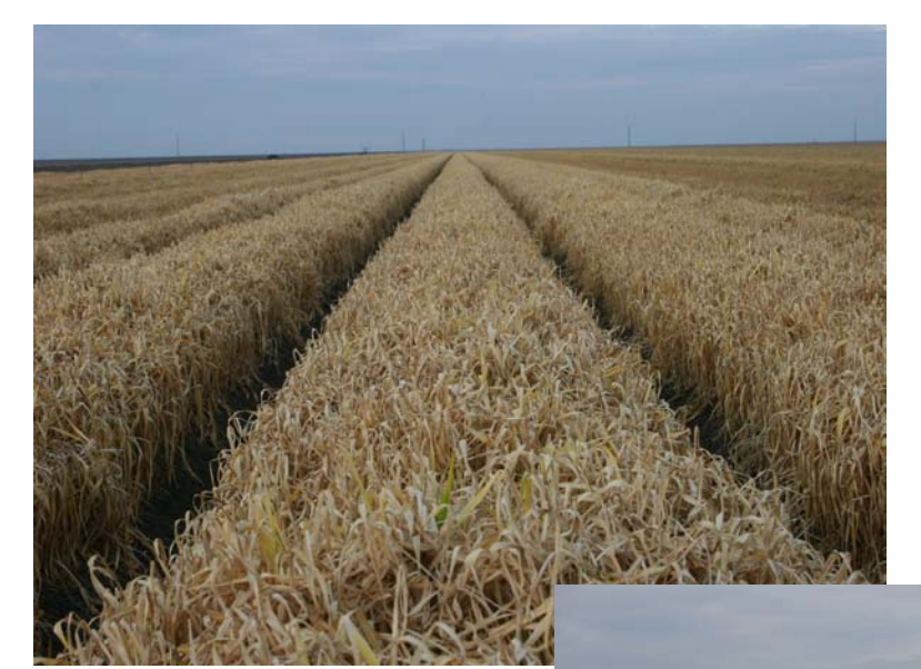
Photo 5. Herbicide treated triticale cover crop dying or "melting down," Sano Farm, Firebaugh, CA 2007