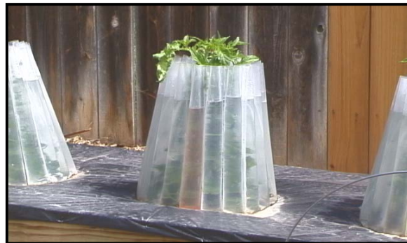
Figure 8. Tomato in Wall-of-Water. Notice use of black plastic mulch to warm the soil, another limiting factor of early production. Also, note the plant has grown beyond the device and is now less protected from frost.

This device works on the chemistry principle of heat release in a phase change; there is a significant amount of heat released as water freezes (changes from the liquid phase to the solid or ice phase). A Wall-of-Water provides frost protection typically down to mid-teen F temperatures. It also provides wind protection for tender plants and growing temperatures may be slightly warmer inside a Wall-of-Water.