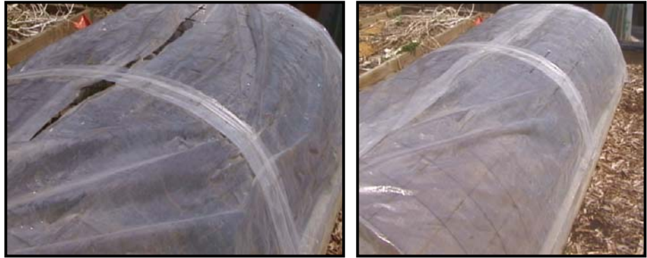
Figure 5. Left: Cover must be opened at least a slit to prevent over-heating. Right: Cold frame pictured closed for a cold night.

On cool days, open the top a crack to prevent excessive heat build-up. On a warm day, the plastic can be slid down the side, ventilating and providing crops exposure to the outdoors. On freezing nights, close the cover completely. On warm nights, the covers may be left open a crack. On stormy days with full cloud cover and no direct sun, the cover may remain closed. [Figure 5]