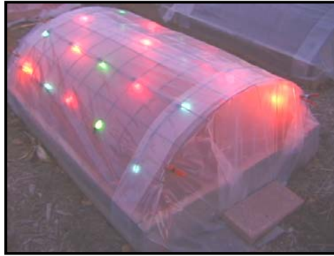
Figure 7. Cold frame with Christmas tree light for additional warmth.

Christmas tree lights – For additional protection, add Christmas tree lights inside the cold frame. In Fort Collins trials, one 25 light string of C-7 (mid-size) Christmas lights per frame unit (four feet wide by five feet long) gave 6° F to over 18° F frost protection. Lights were hung on the frame under the plastic and turned on at dusk and off at dawn. Christmas lights work better than a single, large light bulb in the center by eliminating cold corners and edges. [Figure 7]