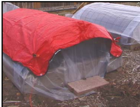
Figure 6. Aluminum space blanket covering a cold frame for extra protection on cold nights.

In trials in Fort Collins, topping a plastic-covered, concrete mesh cold frame with a space blanket prevented freezing when outside temperatures dipped to 0° F following a sunny spring day. The space blanket must be removed each day to recharge the soil's stored heat