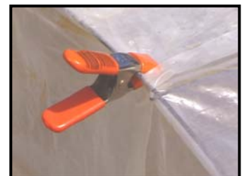
Figure 4. Clip holds plastic on frame.

Hold the plastic onto the frame with small clips available at local hardware stores. Clothes-pins do not hold in the wind. Another method is to use a series of 6-inch wide, belt-like plastic straps arching over the frame (above the plastic cover) and stapled onto the box. Open and close the cover by sliding it between the frame and the belt-like straps. Hold the plastic closed at the ends with a rock or brick. [Figure 4]