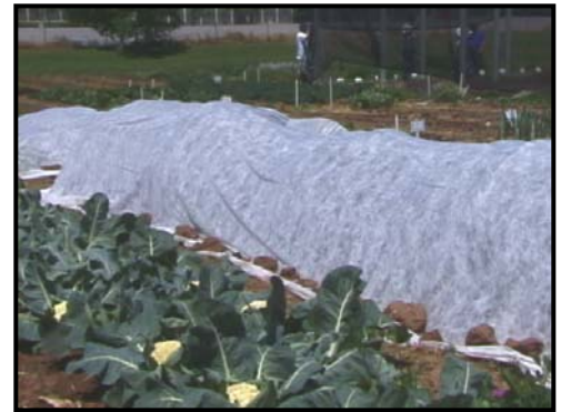
Figure 2. Floating row cover on broccoli and cabbage, protecting crops from cabbageworms.

Floating row covers are popular in commercial vegetable production where crops planted in large blocks are easily covered with row covers. Many brands and fabric types are commercially available.