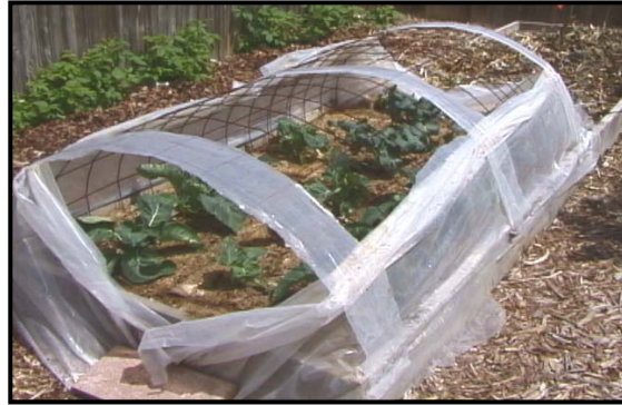
Figure 3. Cold frame for a raised-bed garden made from concrete reinforcing mesh covered with 4-mil plastic. Notice the belt-like plastic straps, which hold the covering in place. The covering is slid between the straps and mesh to open and close. Pictured open for ventilation on a warm day.

An easy cold frame structure for a growing bed is made with 4-mil clear plastic (polyethylene film) draped over concrete reinforcing mesh. The structure is easily opened during warm days and closed for cold nights. It works well with a 4-foot wide, raised-bed garden system. [Figure 3]