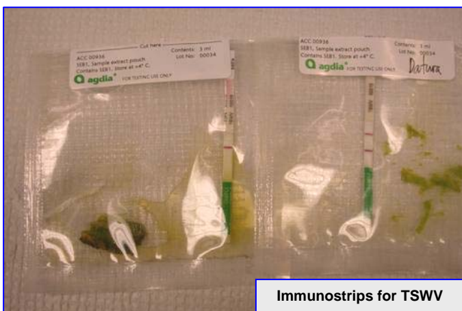
Immunostrips for TSWV

There are several sensitive and reliable detection methods for TSWV. These include enzyme-linked immunosorbent assay (ELISA), a serological (antibody)-based method; and polymerase chain reaction, which detects the viral RNA. However, ELISA and PCR are methods that require laboratory facilities. More recently, a test was developed for TSWV that can be conducted in the field in 15-30 minutes. This test, referred to as immunostrips, is serologically-based, but involves only sticking a 'strip' into a plastic bag with plant sap, allowing the sap to move up the strip and observing whether one or two lines appear at a certain point. One line is a control that tells you the strip was functional and the other indicates infections with TSWV. These immunostrips allow for rapid confirmation of infection in the field and require no laboratory facilities.