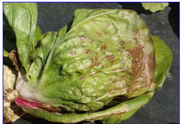
Tomato Spotted Wilt Symptoms in Radicchio

Radicchio crops sampled in fall-winter of 2005, spring - fall of 2006 and most recently in spring of 2007 have continually tested positive for TSWV and are capable of hosting a high population of thrips.