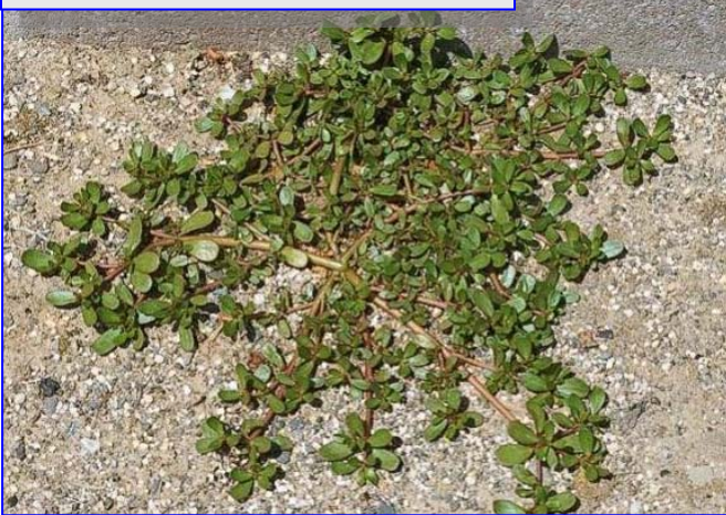
Common purslane ( Portulaca oleracea )

Outlook was applied pre transplant over the entire bed top and at layby as a directed spray to the base of the peppers. No crop phytotoxicity was observed with these applications. Broadleaf weed control was very good, but not excellent with this application method. There were