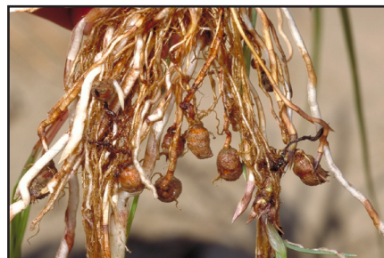
Figure 4. Yellow nutsedge roots, rhizomes, and tubers.