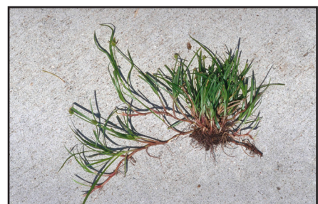
Figure 7. Green kyllinga doesn't have tubers as do nutsedges but instead spreads by rhizomes.