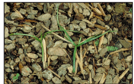
Figure 8. Yellow nutsedge seedling emerging through bark mulch.

because it will move the tubers around in the soil. However, repeated tillings of small areas before the plants have 6 leaves will reduce populations. If you find nutsedge in small patches in your turf, dig out the patch down to at least 8 inches deep, refill, and then seed or sod the patch.