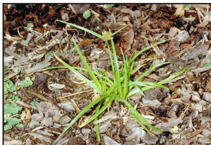
Figure 1. Mature yellow nutsedge plant.

Yellow and purple nutsedges produce tubers, which are incorrectly called “nuts” or “nutlets,” thus the origin of their common name. The plants produce these tubers on rhizomes, or