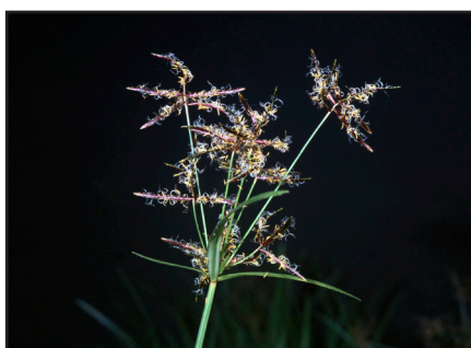
Figure 2. Mature purple nutsedge flower.

underground stems, that grow as deep as 8 to 14 inches below the soil surface. Buds on the tubers sprout and grow to form new plants and eventually form patches that can range up to 10 feet or more in diameter.