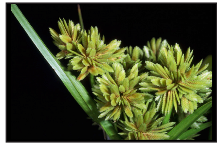
Figure 6. Flowers of tall umbrella sedge (shown here) are dense and headlike in contrast to the looser flowers of nutsedge. Plants also lack tubers and are taller and have wider leaves than the nutsedges.

The best way to remove small plants is to pull them up by hand or to hand hoe. If you hoe, be sure to dig down at least 8 to 14 inches to remove the entire plant. Using a tiller to destroy mature plants only will spread the infestation,