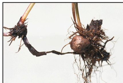
Figure 5. Purple nutsedge root system showing tubers linked in chains.