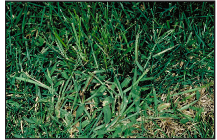
Figure 2. Large crabgrass in a lawn.

Seedling leaves are light green and hairy. True leaves are generally 3 inches long and hairy on the upper surface of the leaf and leaf sheath. The collar region and flower stalk are similar to that of smooth crabgrass, but the branches are longer—about 2 to 5 inches—at the end of the stalk. One source reports seed production from a single, large crabgrass plant can be as high as 150,000.