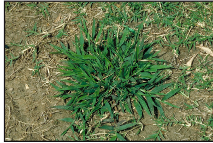
Figure 1. Smooth crabgrass.

Seedling leaves are light green and smooth (Fig. 3). They are very conspicuous in the lawn with their lighter green color. True leaves are dark green but still smooth, and the leaf blade is from \frac{1}{4} to \frac{1}{3} inch across, up to 5 inches long, and pointed. Crabgrass often forms patches in lawns, and plants can grow together to form large clumps. The projection at the base of the leaf blade, known as the ligule (Fig. 4), is small