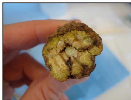
Figure 2. Gall tissue can girdle twigs and stems.

ings that occur when the tree drops its leaves, flowers, or fruit, through wounds resulting from natural events such as frost injury or hail damage or by wounds caused by cultural practices such as pruning and harvesting (Fig. 3). Pruning wounds can remain susceptible to infection for at least 14 days. Leaf scars, however, are the most common points of pathogen entry and can remain susceptible to infection for up to 7 days after leaf drop (abscission).