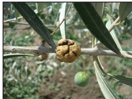
Figure 1. Olive knot galls form on twigs at sites of infection by Pseudomonas savastanoi .

Both the epiphytic pathogen population and bacterial ooze emitted from galls can serve as primary inoculum (infectious propagules) for the development of new infections (Fig. 3). The pathogen can be transmitted both within a plant and to neighboring plants in wind-blown rain or over larger distances on contaminated pruning tools or infected nursery stock. The pathogen can infect the plant through natural open-