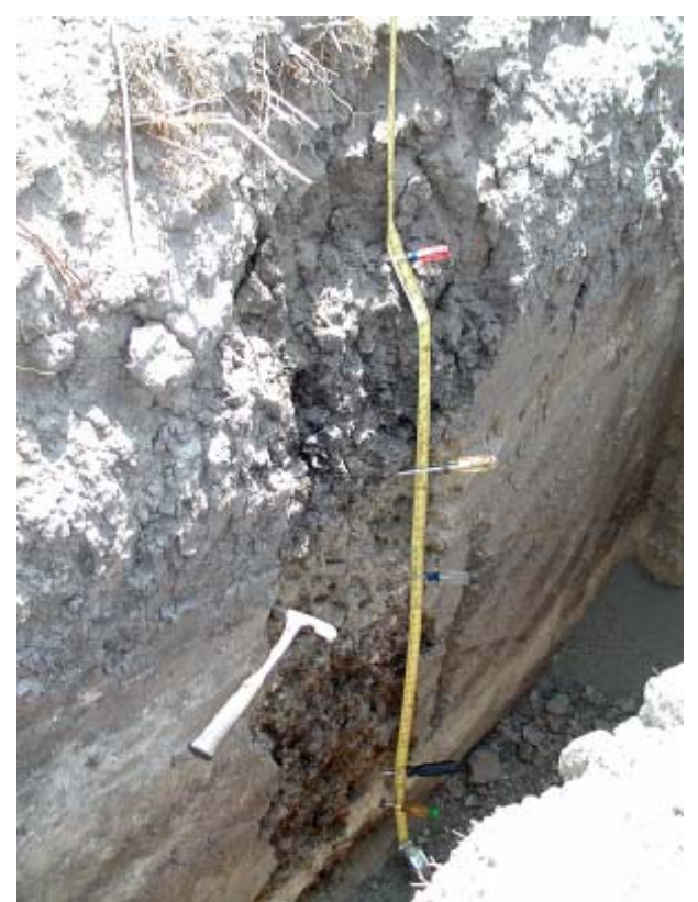
Plate 2. Backhoe pit in a Buttonwillow clay soil with a slightly caliche silty clay layer at the 34-45 inch depth. Total depth 80 inches.