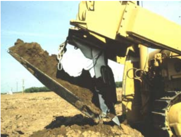
Plate 4. Slip plow with a following foot to further lift and mix layers.