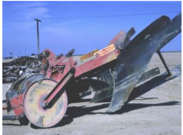
Plate 5. Moldboard plow capable of penetrating 3 to 4 feet.