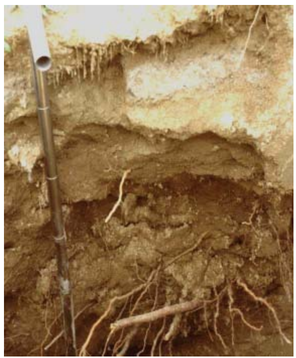
Plate 3. A marginally alkali clay loam in the top 2 feet of this almond rootzone overlays a coarse sandy loam layer. Excess moisture in the heavier layer prevented good root development in the top 2 feet.