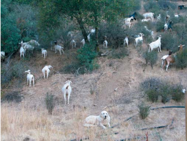
Goats grazing brush.

reported that adding cutting and herbicide use increased sheep effectiveness by reducing the brush below 20% in one year, but increased the costs. 5