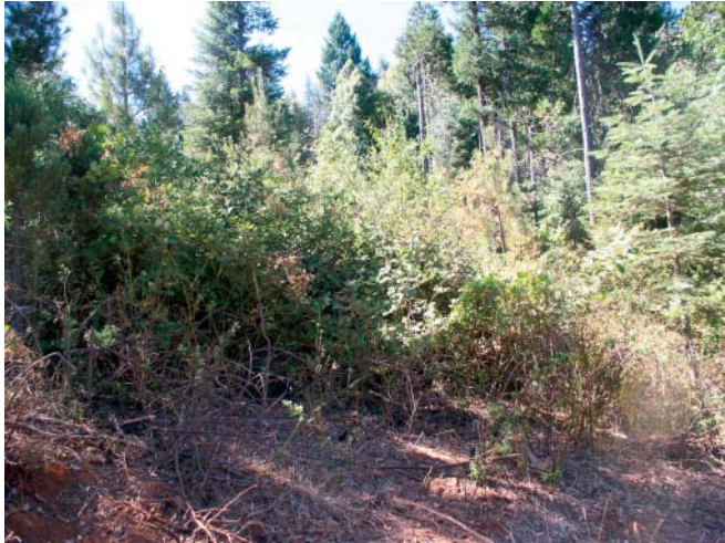
Edge of goat grazed area in Ponderosa forest.

days per acre), the basal regrowth of the oaks was closely cropped and the vegetation was maintained as predominantly open woodland. In the paddock that was grazed more moderately (49–60 cow grazing days per acre), the vegetation tended to return to dense thicket. 12