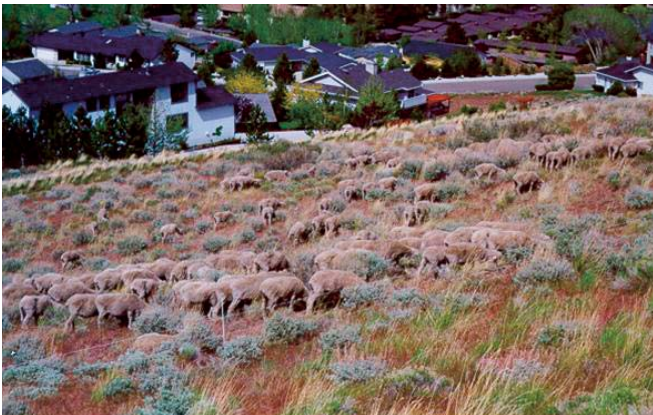
Sheep grazing a fuel break in Nevada.

electric fences. These misconceptions by the public must be addressed when land managers make proposals for grazing.