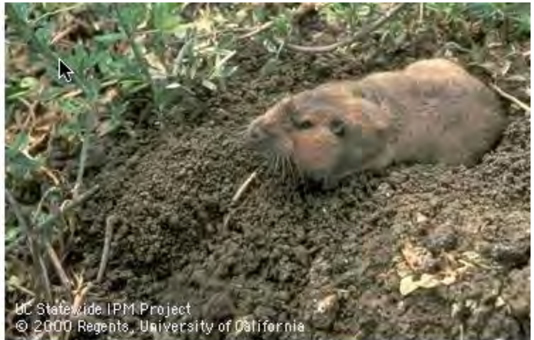
Adult pocket gopher, Thomomys sp.