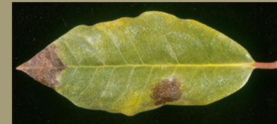
Symptoms on a rhododendron leaf