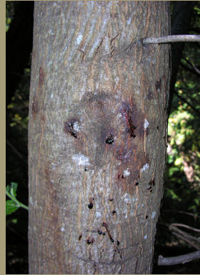
Symptoms on an oak trunk

Ramorum blight, which is a foliar and twig infection. For the most current list of regulated host plants, go to www.suddenoakdeath.org .