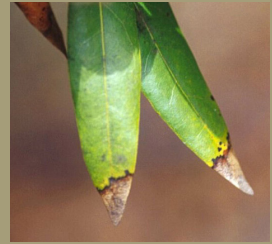
Symptoms on California bay laurel leaves

Plants with Ramorum blight show symptoms of leaf spots and twig dieback. Pathogen spores can build up rapidly on the leaves and twigs of these hosts. California bay laurel ( Umbellularia californica ) is the single most important foliar host driving natural P. ramorum spread in California wildlands, while a varied group of common ornamental plants, including Rhododendron , Camellia , Viburnum , and Pieris , are involved in most nursery infestations.