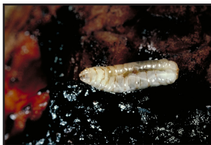
Figure 2. Walnut husk fly larva feeding beneath the skin of a walnut husk.