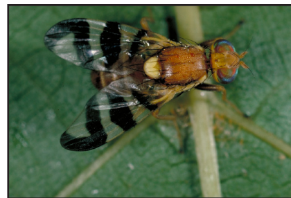
Figure 1. Banded wings of the adult walnut husk fly.

Certain general sanitation practices that reduce the number of husk flies