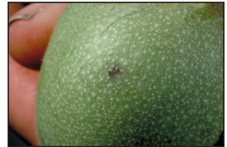
Figure 6. The dark area on this walnut husk indicates the walnut husk fly has laid eggs beneath the surface.