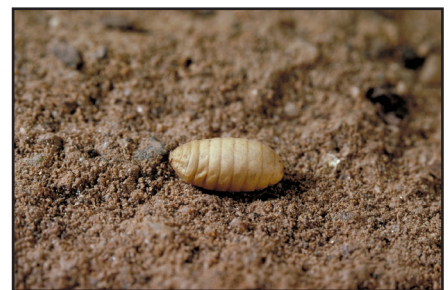
Figure 7. Walnut husk fly pupa on a soil surface.