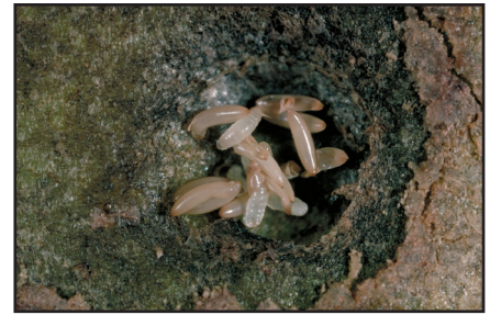
Figure 5. Walnut husk fly eggs beneath the skin of a walnut husk.