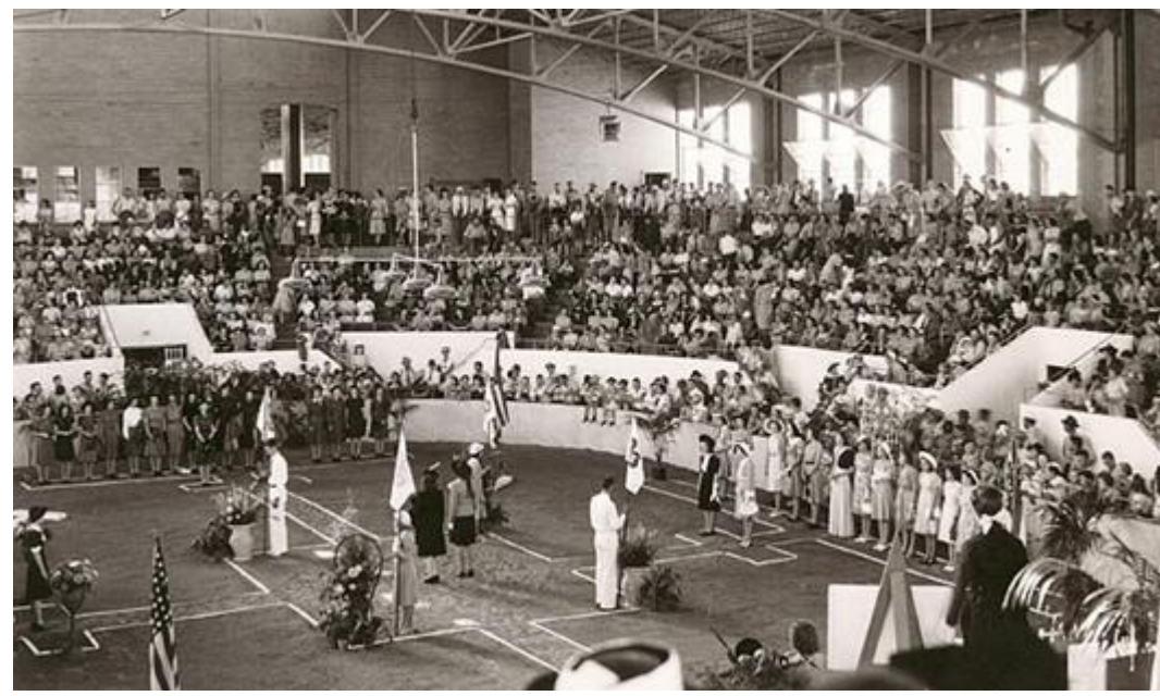
Nebraska State Fair 4-H Style Show, 1940

The early Fashion Competitions & Revues extended to County Fair Competitions, and eventually to State Fair Competitions and Style Shows.