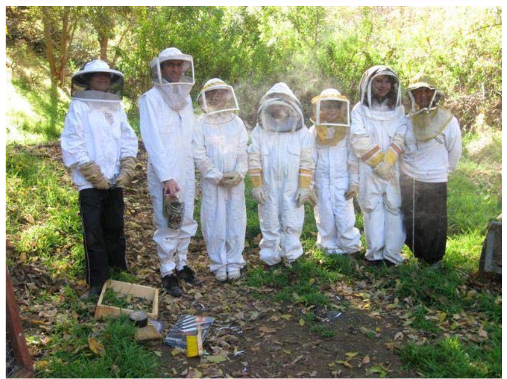
PVP Club members in the Bee Project..