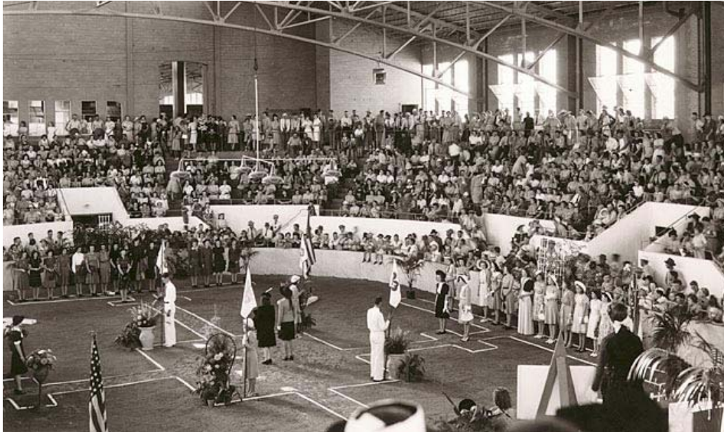
Nebraska State Fair 4-H Style Show, 1940

The early Fashion Competitions & Revues extended to County Fair Competitions, and eventually to State Fair Competitions and Style Shows.