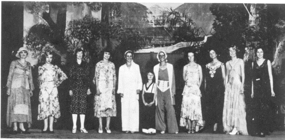
Florida 4-H Fashion Revue of years past

This tradition in 4-H is well-loved and long-standing, and not only is it interesting, but important, to know a little bit about the history of the Fashion Revue, why we do it, and what skills can be learned from participating in this fun and exciting event.