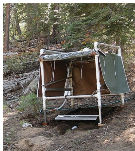
A rainfall simulator, above, at Bliss State Park was used at different rates to generate runoff and measure its sediment content.

We considered the results in terms of soil, runoff, infiltration and particle-size distribution. The soil section included measurements of several soil properties, which were repeated to test for changes before and after rainfall simulations. Runoff timing, sediment yield and organic matter content were contrasted between the two treatments (surfactant and untreated water). Infiltration rates were compared between and within (by treatment) each site for both methods. The MDI and rainfall-simulator data were also compared. Finally, particle-size distribution analysis revealed differences by soil type and any correlations between particle-size fractions and infiltration.