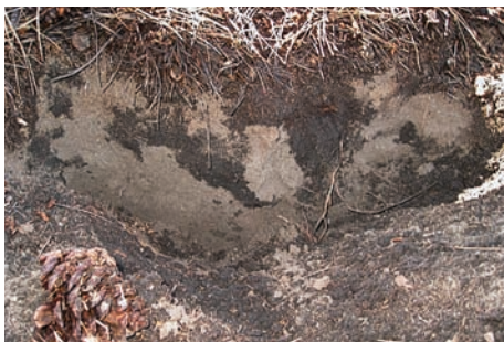
At the Meyers road cut site, a soil excavation shows water infiltrating the soil in "fingers" of flow.

This was also confirmed by a similar treatment effect at the granitic sites, although Truckee and Blackwood differed from one another. Water treated with surfactant infiltrated much more efficiently than untreated water at all sites except Blackwood ( P = 0.2747 ), where the infiltration rate with surfactant exceeded that for water by only 20%. The surfactant rate was greater than the untreated-water rate by a factor of about three at Truckee ( P = 0.0029 ), four at Bliss ( P = 0.0003 ) and eight at Meyers ( P < 0.0001 ). The greatest infiltration rate was found at Blackwood Canyon using untreated water, but that site had the lowest rate with surfactant. The untreated-water infiltration rate at Blackwood was about twice that of Truckee or Bliss, and five times higher than at Meyers. Surfactant infiltration rates at Bliss and Truckee, which