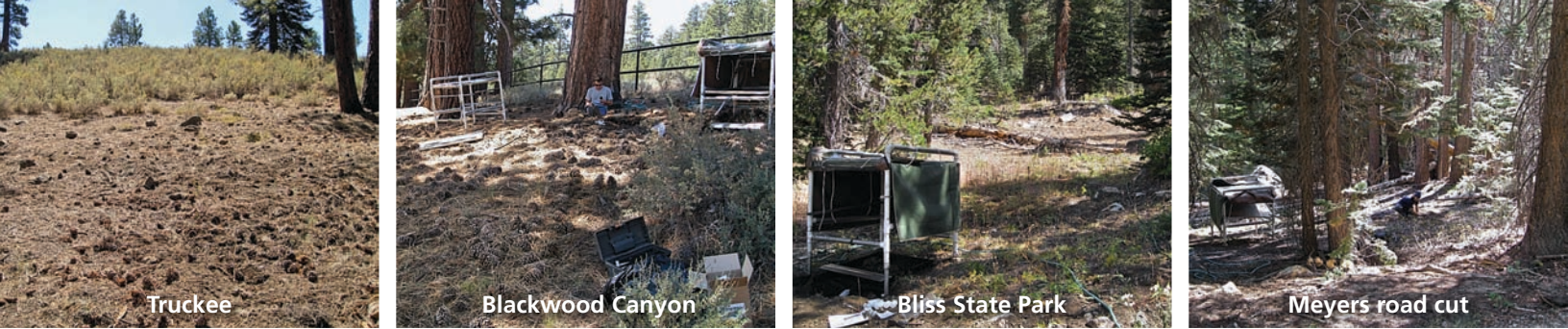
Researchers studied soil repellency with and without surfactant treatments at four sites in the Lake Tahoe Basin.

the redistribution of hydrophobic substances (Doerr and Thomas 2000).