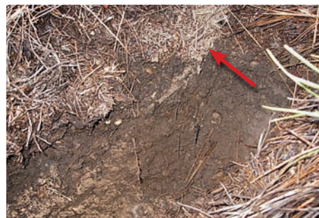
At the Truckee site, dry patches or layers of organic material remained above the wetted mineral soil.

Particle-size distributions. As found by Grismer et al. (2008), volcanic soils were much finer than granitic soils at each particle-size percentile (D 10 , D 25 , D 50 , D 75 , D 90 ), and particle sizes differed significantly by soil type (table 5). Volcanic particles were typically about one-fourth the size of granitic particles. Ten percent of particles occurring in runoff from volcanic soils were less than 8 \mu\text{m} , a size fraction considered detrimental to lake clarity (Swift et al. 2006). The relationship between particle-size distribution and infiltration rate appeared to be nonlinear, making the Spearman correlation an appropriate test. All particle sizes were strongly, negatively correlated with infiltration rates. For the rainfall-simulator-based infiltration rates, Spearman correlations for the D 10 , D 25 , D 50 , D 75 and D 90 particle sizes were R = -0.86, -0.91, -0.83, -0.89 and -0.69 , respectively; similarly, for the MDI-based infiltration rates, the Spearman correlations were R = -0.80, -0.70, -0.74, -0.68 and -0.76 , respectively.