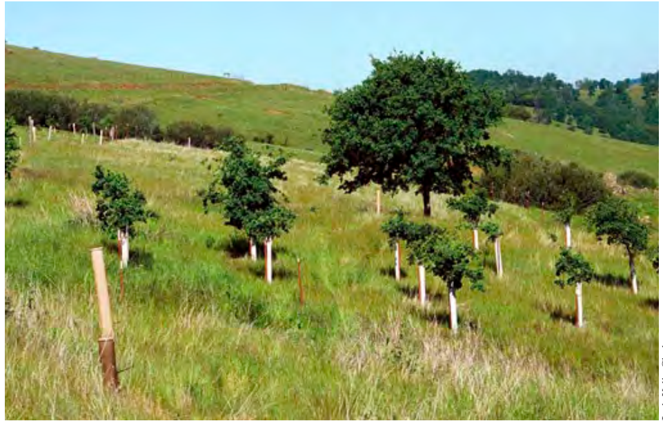
Jack Kelly Clark

Most oak woodlands in California have an understory of dense, non-native annual vegetation. These plants compete with oak seedlings for moisture and nutrients and can severely limit their growth and survival. It is therefore important that these plants be controlled. Eliminating weeds near planted oaks by scalping (i.e., hoeing),