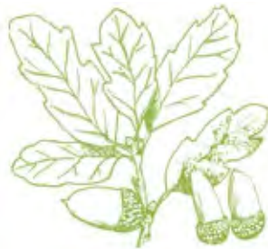
Hart Gordon Bailey

In addition to dropping its leaves in winter, it exhibits drought deciduousness—that is, the capacity to shed foliage earlier than normal in response to drought.