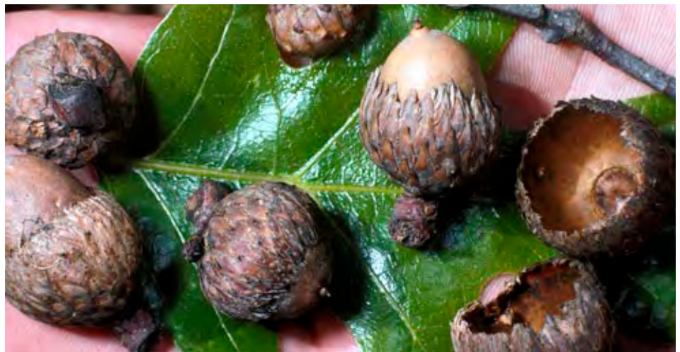
Acorn production among California oaks is highly variable from tree to tree and from year to year.

not regenerating well in certain areas of the state. In addition to poor natural regeneration, the total acreage of these species has been depleted from residential and commercial development, range improvement, agricultural conversions, and firewood harvesting. To ensure that these species remain important components of the natural landscape of California, it may be necessary to encourage natural regeneration or to actively restore oaks by planting acorns or seedlings. During the last 20 years, much has been learned about what works and what does not. Based on research and field trials, we now feel we can successfully regenerate native oaks, although it is often necessary to carefully plant and maintain them. Below are general guidelines for encouraging natural regeneration; collecting, storing, and planting acorns; growing seedlings in containers; and outplanting acorns and seedlings in the field. Additional information is available in Regenerating Rangeland Oaks in California , UC ANR Publication 21601 (see “References”).