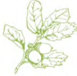
Hart Gordon Bailey

This semideciduous oak has a narrow distribution, primarily in western San Diego County, where it replaces blue oak as the dominant species. It has been severely impacted by agricultural conversions and, along with blue oak and valley oak, is not regenerating well.