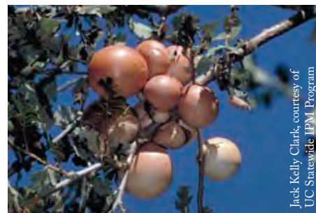
Jack Kelly Clark, courtesy of UC Statewide IPM Program

Innumerable insects live on the leaves, branches, trunk, and roots of oak trees, usually without much adverse impact—especially if the tree is vigorous and healthy. Most oak galls, for example, are harmless swellings in response to enzymes released when small gall wasps lay their eggs and the larvae begin to feed. Some of these galls look like dangling Christmas ornaments, while others form exotic multicolored shapes on oak leaves that can resemble sea urchins, sponges, or Chinese hats.