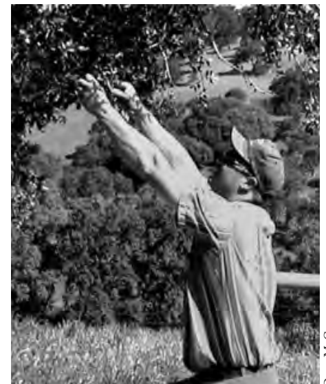
Acorns can be collected from the branches of oak trees.

rapidly lose viability if they dry out, so it is important to place them in plastic bags in cold storage soon after they are collected. They can be stored for several months, but members of the white oak subgenera, including both blue and valley oak, will germinate in cold storage and begin to grow a radicle, or new root. Acorns do not store well, and it is therefore important to plant them as soon as the soil becomes sufficiently moist after the first rains in the fall. They should be placed on their sides and planted between 0.5 and 1.0 inch (10 and 25 mm) deep. The chances of vigorous initial growth can be improved by excavating a hole several inches wide and up to 1.5 feet (50 cm) deep prior to sowing (and filling the hole back up with soil), which allows the initial root to more easily grow downward. Direct planting of acorns eliminates the root disturbance that occurs with transplanting seedlings and allows more natural root development.