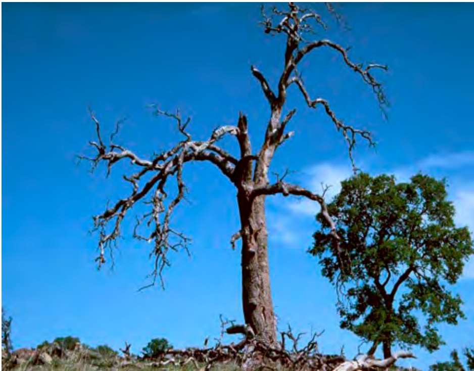
Although oaks are long lived, all trees eventually die. Adequate regeneration is necessary for a species to survive and prosper.

bark that provides wildlife cover and insect prey, abundant acorns, and nesting cavities in large limbs and trunks, both living and dead. Fallen leaves and other material from the canopy provide nutrients under these trees that support a host of soil invertebrates. At the landscape scale, a large, lone tree provides connectivity between wooded patches, adds structural diversity, and may provide a safe stopping point for migrating birds. Large trees have been referred to as a keystone species; that is, their ecological benefits are disproportionate to their numbers. Large dead trees in woodlands, called snags, are generally rare, but they provide important cavity and perch sites. They should