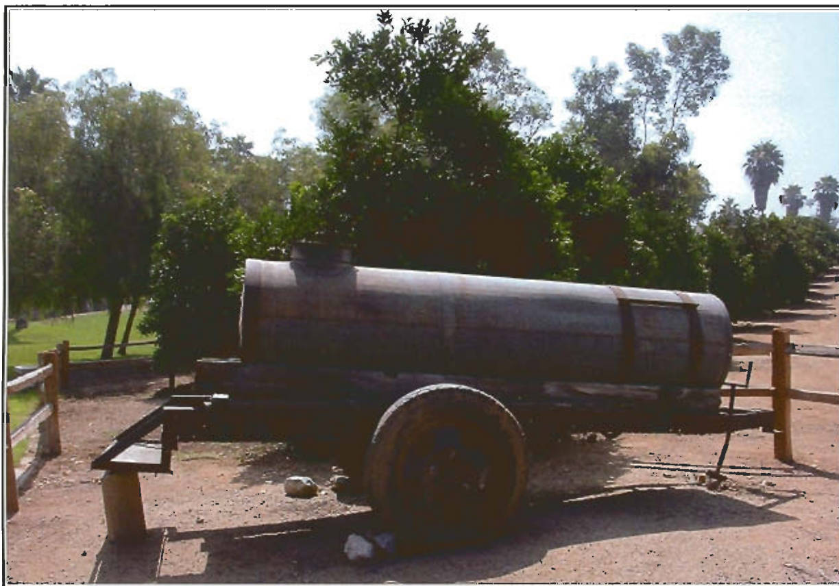
Picturesque sites along the walking trail of the California Citrus State Historic Park.