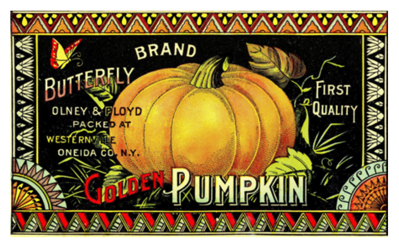
Happy Fall Harvest Season from the LA County 4-H Staff--