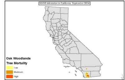
GSOB Distribution September 2014

Spread and Damage Since being identified in 2002, a non-native invasive beetle, the goldspotted oak borer (GSOB - Agrilus auroguttatus ), has killed an estimated 80,000 oak trees in San Diego County. Previously, GSOB occurrence in the U.S. was limited to southeastern Arizona. Scientists believe that GSOB was introduced to San Diego County through the movement of infested firewood from Arizona. GSOB is causing significant tree losses across all ownerships in San Diego. GSOB was discovered in Riverside County in 2012, likely as a result of the movement of firewood from San Diego.