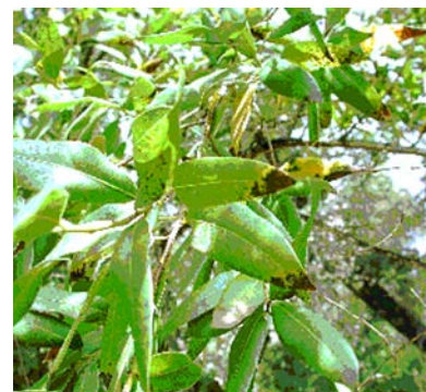
Photo 2. California bay laurel (also called pepperwood, or Oregon Myrtle) showing leaf spots typical of Phytophthora ramorum .