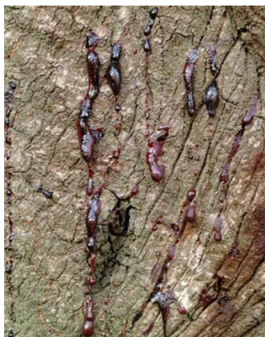
Photo 6 (right). Bleeding cankers on a tanoak trunk.