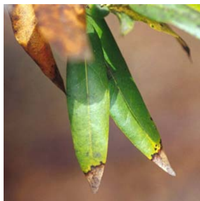
Photo 3 (left). Bay laurel leaf spots.