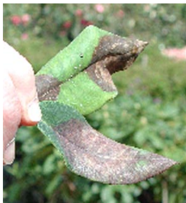
Photo 4 (right). Rhododendron leaf spots.