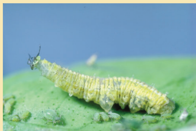
Syrphid fly larvae eat mostly aphids but also soft-bodied insects.