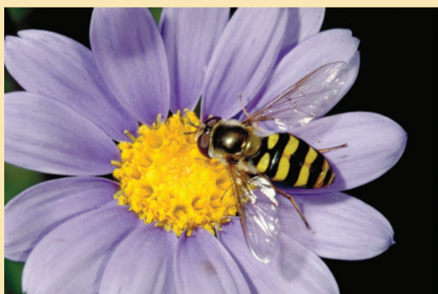
Syrphid fly (flower fly, hover fly) adults eat pollen and nectar.