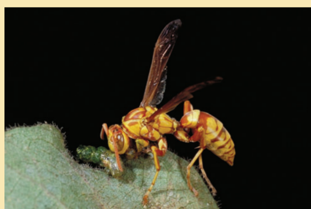
Adults of predatory wasps , such as this paper wasp, prey on caterpillars and other insects.