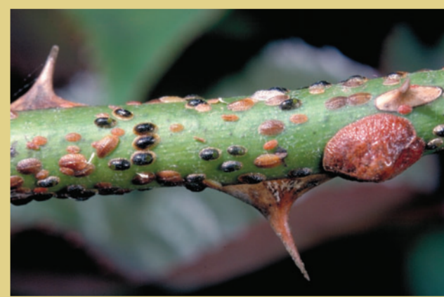
The blackish scale insects have wasp larvae developing within.