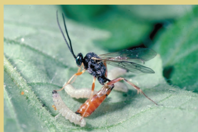
Caterpillar parasites include the Hyposoter exiguae wasp.