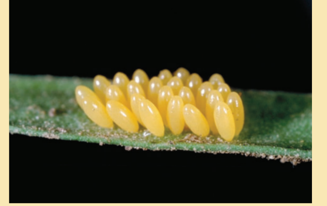
Convergent lady beetles prefer to eat aphids but sometimes eat whiteflies and other soft-bodied insects. Shown here are the adult (left), larva (center), and cluster of eggs (right).