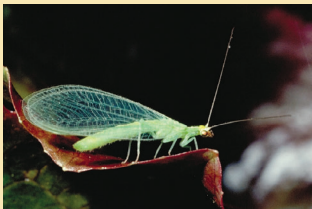
Green lacewing adults eat nectar and pollen. Some species also eat insects.