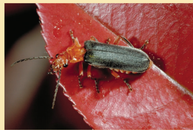
Soldier beetle adults eat mostly aphids; their larvae are soil-dwelling.