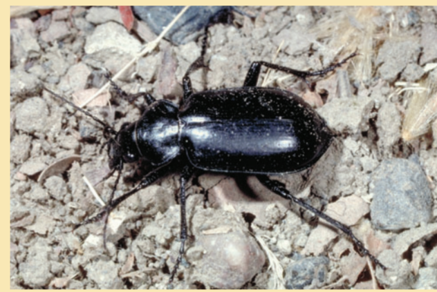
Predaceous ground beetle adults stalk soil-dwelling insects, such as cutworms and root maggots.