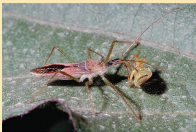
Assassin bugs attack almost any insect.