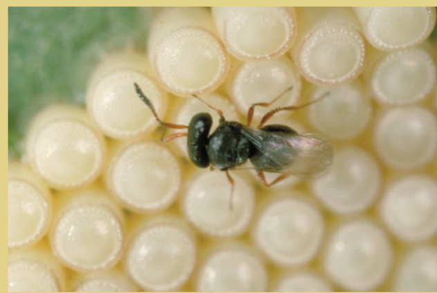
Some parasites attack insect eggs, such as the Trissolcus species wasp.

Parasites live and feed in or on a larger animal (host). Nearly all insect pests have at least one parasite that attacks them. Insects that parasitize other invertebrates (sometimes called parasitoids) are parasitic only in their immature stages and kill their host just as they reach maturity. Most insect parasites are host-specific wasps or flies, and many are so small that often you won't see them. An adult parasite can lay eggs in hundreds of host individuals with a resulting quick reduction in pest numbers.