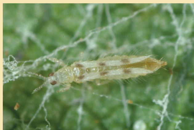
Sixspotted thrips attack mostly mites.