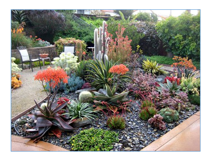
Figure 4. A 3-inch layer of wood chip mulch conserves water, reduces weeds and water runoff.

Avoid overfertilizing. Applying too much nitrogen leads to an overabundance of foliar (leaf) production and the need for more water. Most mature landscape plants will get through a season or two with no supplemental fertilizations. Fruit trees and vegetables require adequate nutrients for crop production. When water is scarce fruit trees should not be fertilized; while the crop may be sacrificed, this practice reduces water requirement and will help keep the tree alive. Annual vegetables may get by on slow release nutrients supplied by organic matter and compost.