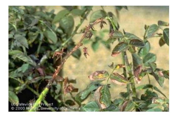
Figure 1. Drought damage on a rose plant (left) and salt damage mimicking drought damage on avocado (right).