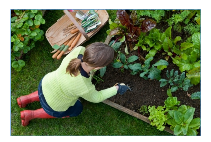
Figure 5. Plant only family favorites and avoid an oversized garden that is larger than your needs. Source : http://ucanr.edu/blogs/blogcore/postdetail.cfm?postnum=13130.

<u>Vegetables</u>: Vegetables are not drought efficient plants and are difficult to maintain during a drought. It is often wise to reduce the overall size of the garden and plant only your favorite types of vegetables when water is limited. Scheduling irrigations based on the water needs of the specific crop during critical periods of growth is essential for vegetable production. Hydrozoning (placing plants with similar water needs in the same area of the garden) allows gardeners using automated drip irrigation systems to target water applications based on water needs of individual zones, reducing water waste.