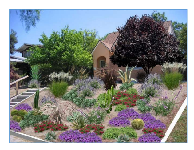
Figure 6. Beautiful, drought-efficient landscapes save water and time and reduce erosion and runoff.