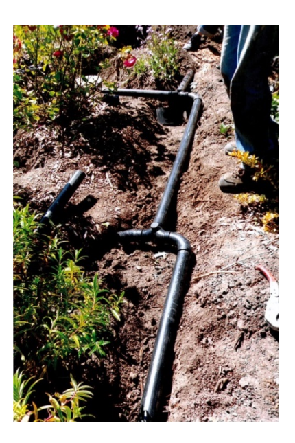
Example of a 'branched drain' graywater system relying on gravity.

'Branched drain' types (shown below) of graywater systems rely on gravity to distribute graywater to mulch basins. While often capturing graywater from showers, they can also be used in conjunction with washing machines as 'laundry to landscape' systems. They only work when plantings are located below the water source since they do not contain an external pump. 'Branched drain' systems are excellent methods of watering trees and shrubs. The final exiting point of each branch are trees and shrubs in mulch basins. While these systems are relatively maintenance-free and efficient once installed the installation process may be difficult and homeowners may want to hire an expert to install them. Like other 'laundry to landscape' systems, no filters need to be changed and no additional wiring or pumps are required and cleanouts can be incorporated for regular, easy flushing.