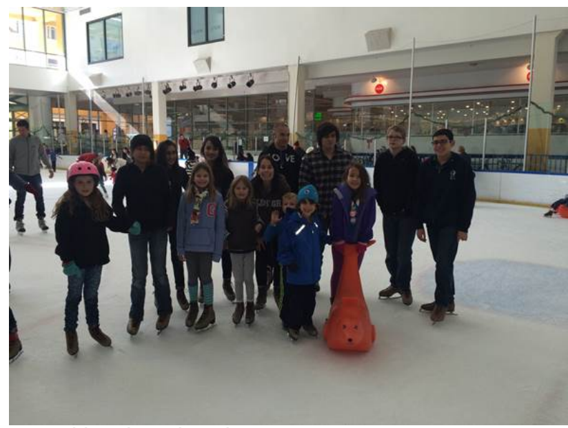
PVP 4-H Club Members at the Ice Skating Party