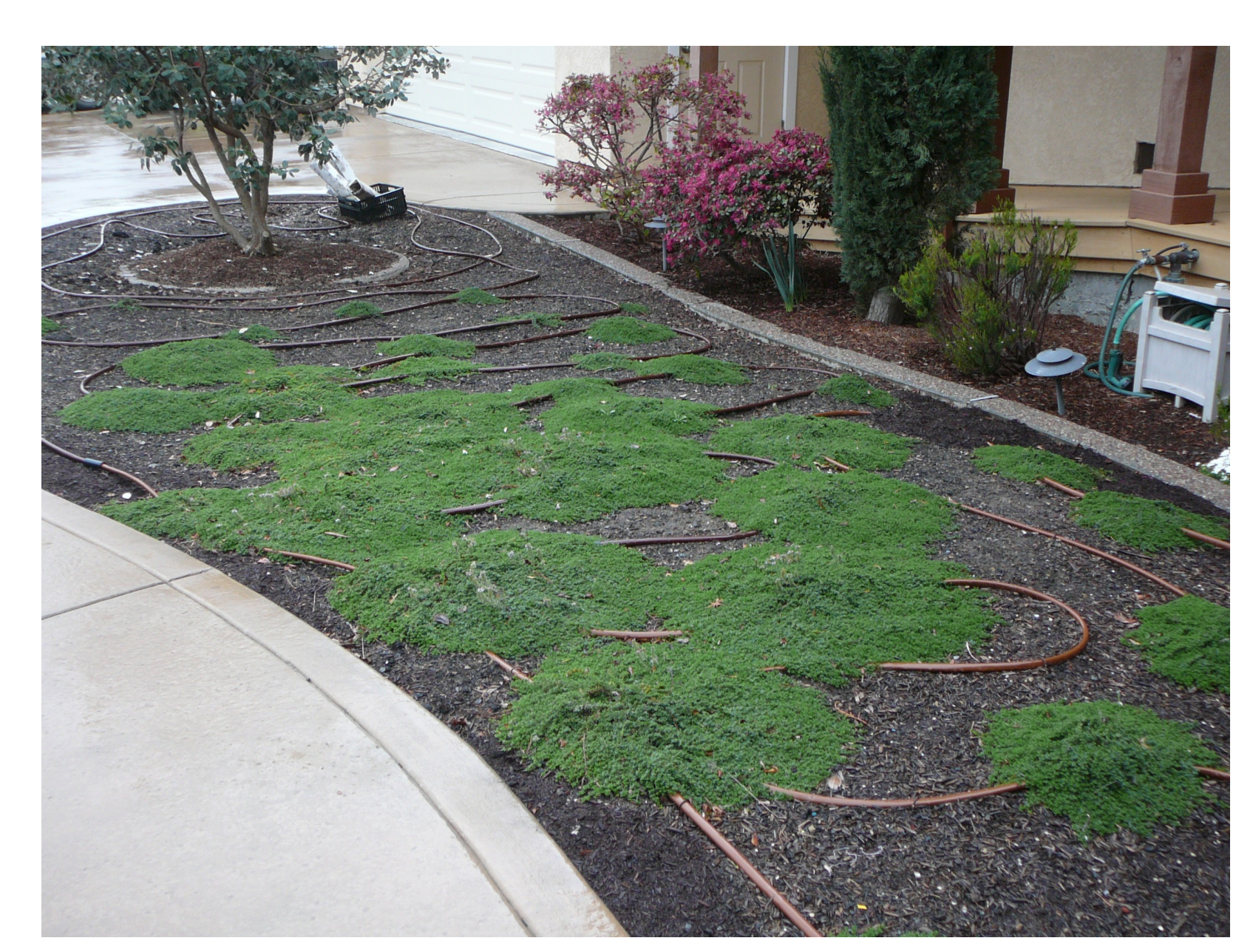
Exhibit E: After planting the topsoil with thyme or another low water using ground cover and VOILÀ! One season later, the ground cover fills in.