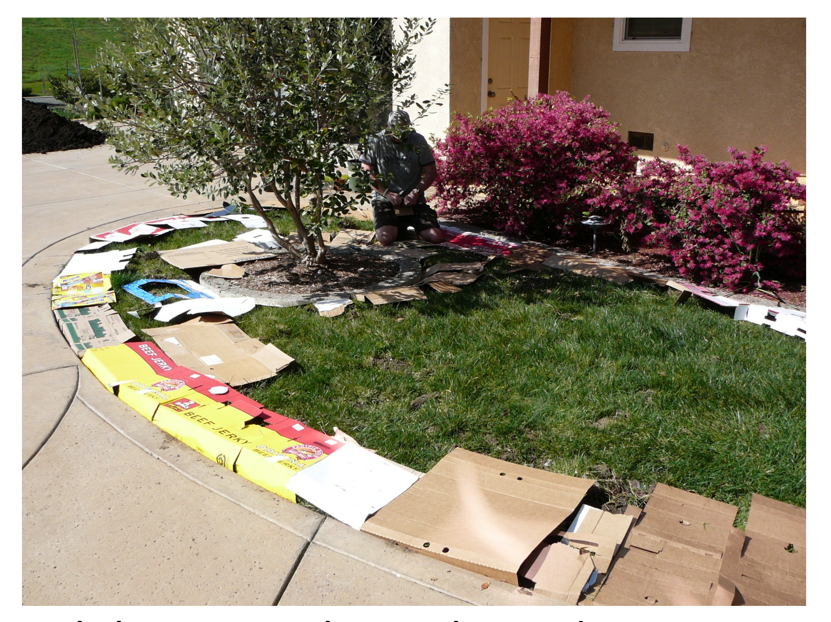
Exhibit B: Gather salvaged cardboard and newspaper. Cover the lawn with the cardboard or newspaper.