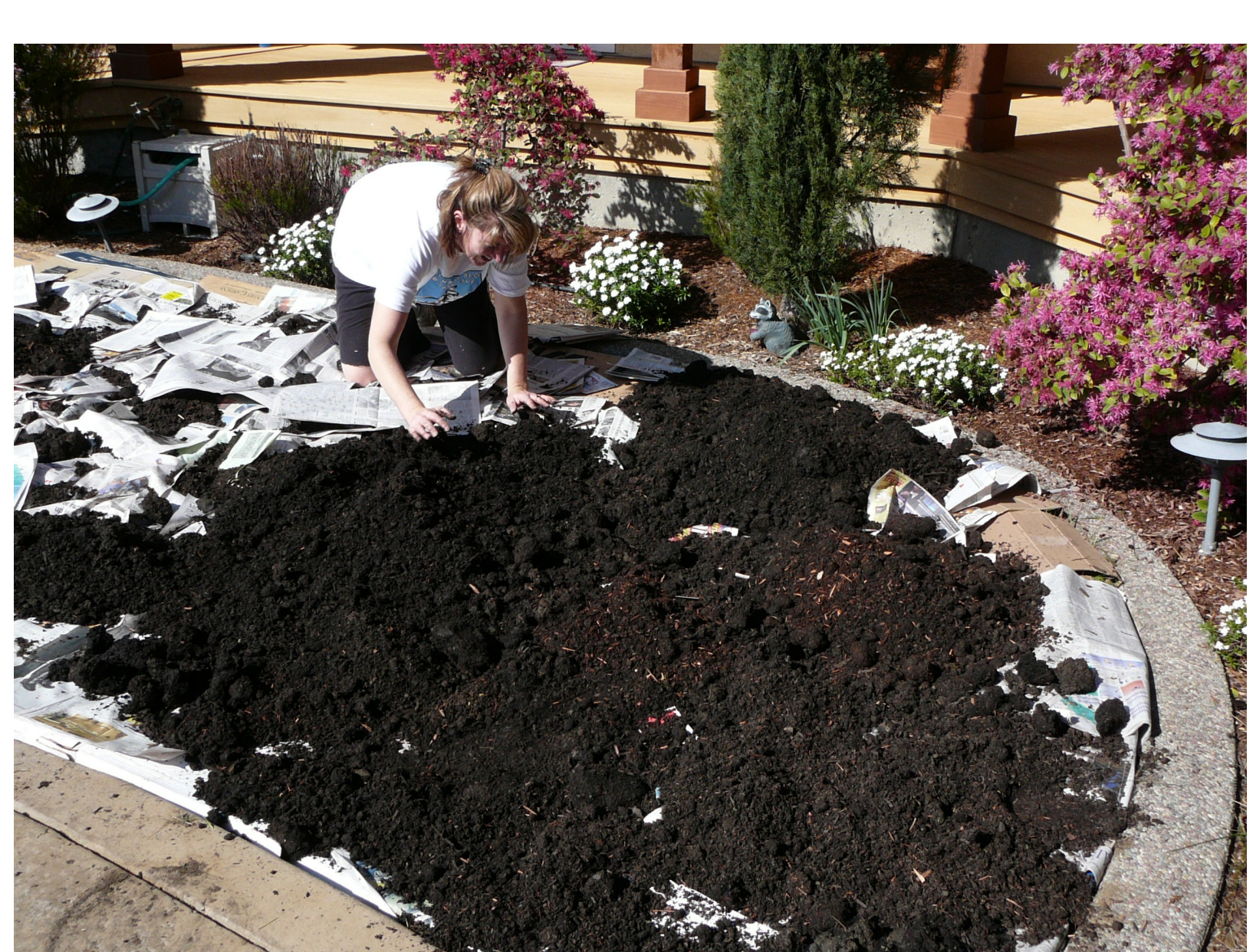
Exhibit C: Cover the cardboard (newspaper) with 3 to 4 inches of top soil (raised bed blend is topsoil/compost mix)