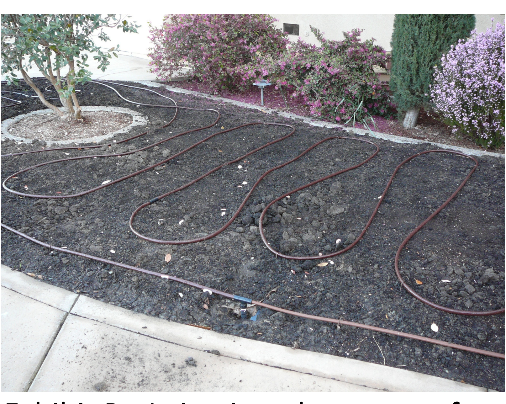
Exhibit D: Irrigation placement of Netafim™ or other drip-type irrigation on the topsoil.