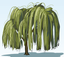
Shape and form

First determine the function of a tree. Is it for shade, windbreak, privacy, aesthetics, or architectural elements? Then choose the best location in the landscape. The site should have enough space for the tree at maturity. Trees too large for the site can lead to future increased maintenance cost and possibly ruin the desired effect.