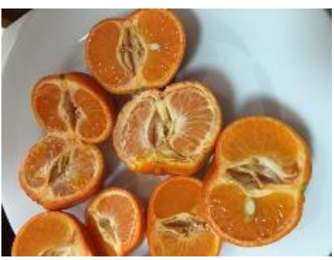
Endoxerosis with the dry outed core.

In the case of sensitive citrus varieties like mandarins, water stress can lead to a pithy core with darker colored seeds, almost as if the fruit had matured too long on the tree.