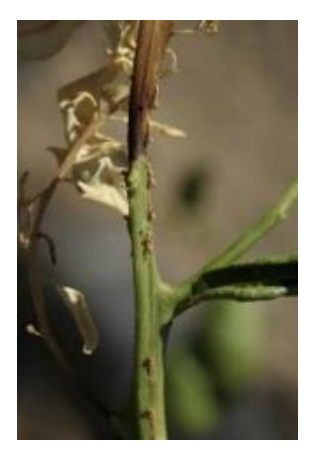
Citrus dieback. In young trees this can grow down to the graft and kill the tree

Salt and Pepper syndrome where large parts of the leaf stems dieback and the rest stays green