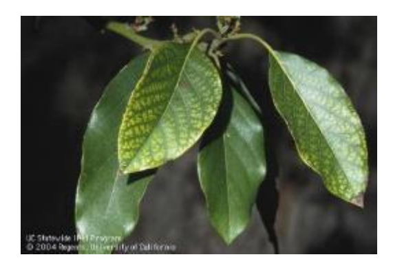
Incipient potassium deficiency from drought