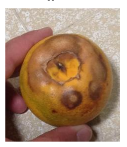
Blossom end rot in citrus