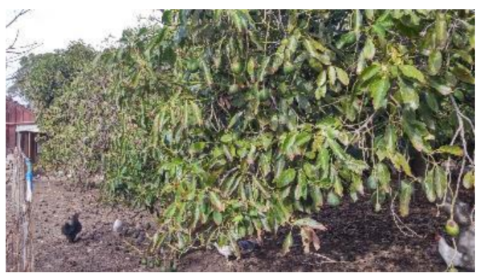
More advanced salt damage. Loss of canopy leaves can lead to fruit sunburn (bottom right hand corner).

As the lack of leaching advances (lack of both rainfall and sufficient irrigation leaching) the canopy thins from leaf drop, exposing fruit to sunburn and fruit shriveling.