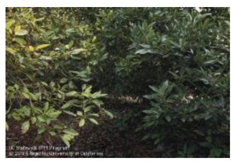
Phytophthora root rot on left from too much water