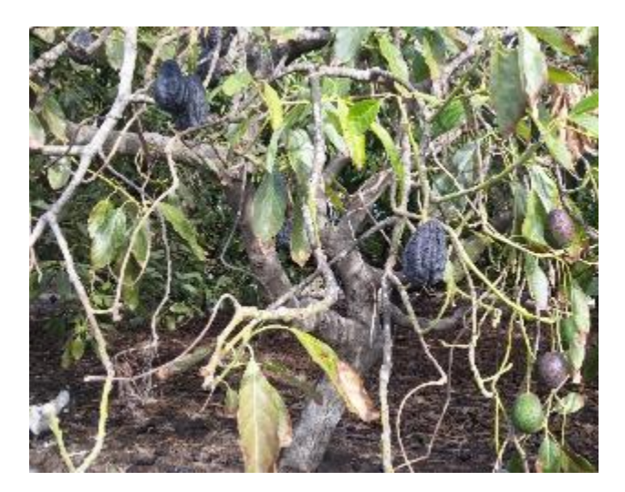
Leaf drop and fruit shriveling in avocado.

As the lack of leaching advances (lack of both rainfall and sufficient irrigation leaching) the canopy thins from leaf drop, exposing fruit to sunburn and fruit shriveling.