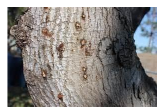
Shot Hole Borer in avocado

Water and salt stress can have all manner of effects on tree growth. It should lead to smaller trees, smaller crops and smaller fruit. The only way to manage this condition is through irrigation management. Using all the tools available, such as CIMIS, soil probes, soil sensors, your eyes, etc. and good quality available water are the way to improve management of the orchard to avoid these problems.