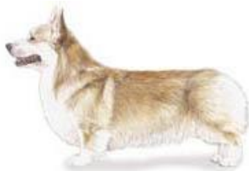
Pembroke Welsh Corgi