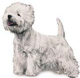
West Highland White Terrier