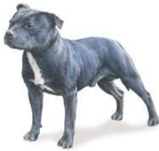
Staffordshire Bull Terrier