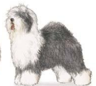
Old English Sheepdog