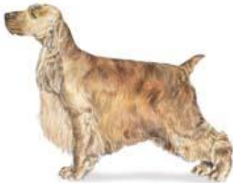
English Cocker Spaniel