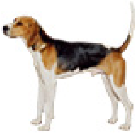
Treeing Walker Coonhound

Miscellaneous GROUP: This group is any purebred dog which is not recognized by the AKC. With continued quality breeding and clear and categorical proof that a substantial, sustained nationwide interest and activity in the breed exists, it may be admitted to registration in the AKC Stud Book and the opportunity to compete in regular classes.