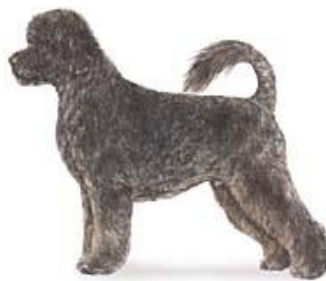
Portuguese water dog