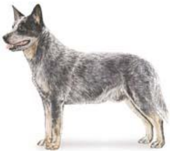
Australian Cattle (not AKC)