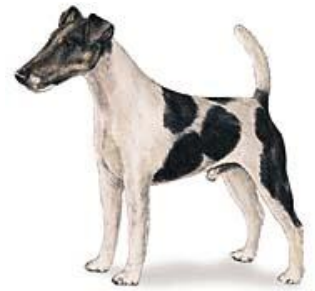
Smooth Fox Terrier