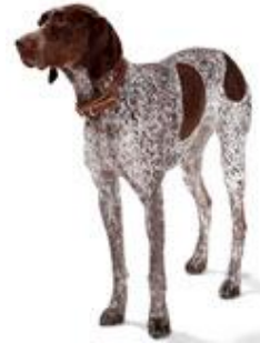
German Shorthaired Pointer