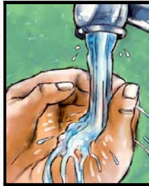
2. Rinse hands and arms well with clear water