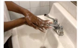
3. Rub hands together for at least 20 seconds.