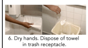
6. Dry hands. Dispose of towel in trash receptacle.