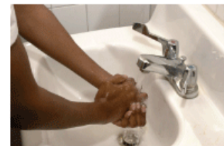
5. Rinse hands thoroughly under running water.