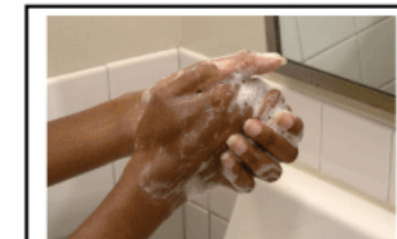
4. Clean under fingernails and between fingers.