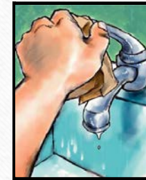
4. Use towel to turn off faucet and to open the door