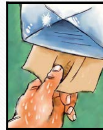
3. Dry hands & arms with paper towel or hot air blower