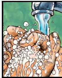
1. Wet hands & arms with 100°F water, apply liquid soap and rub hands for 15 seconds. Use your nail brush