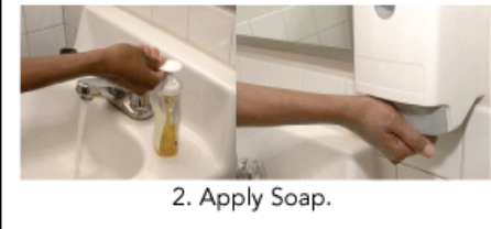
2. Apply Soap.