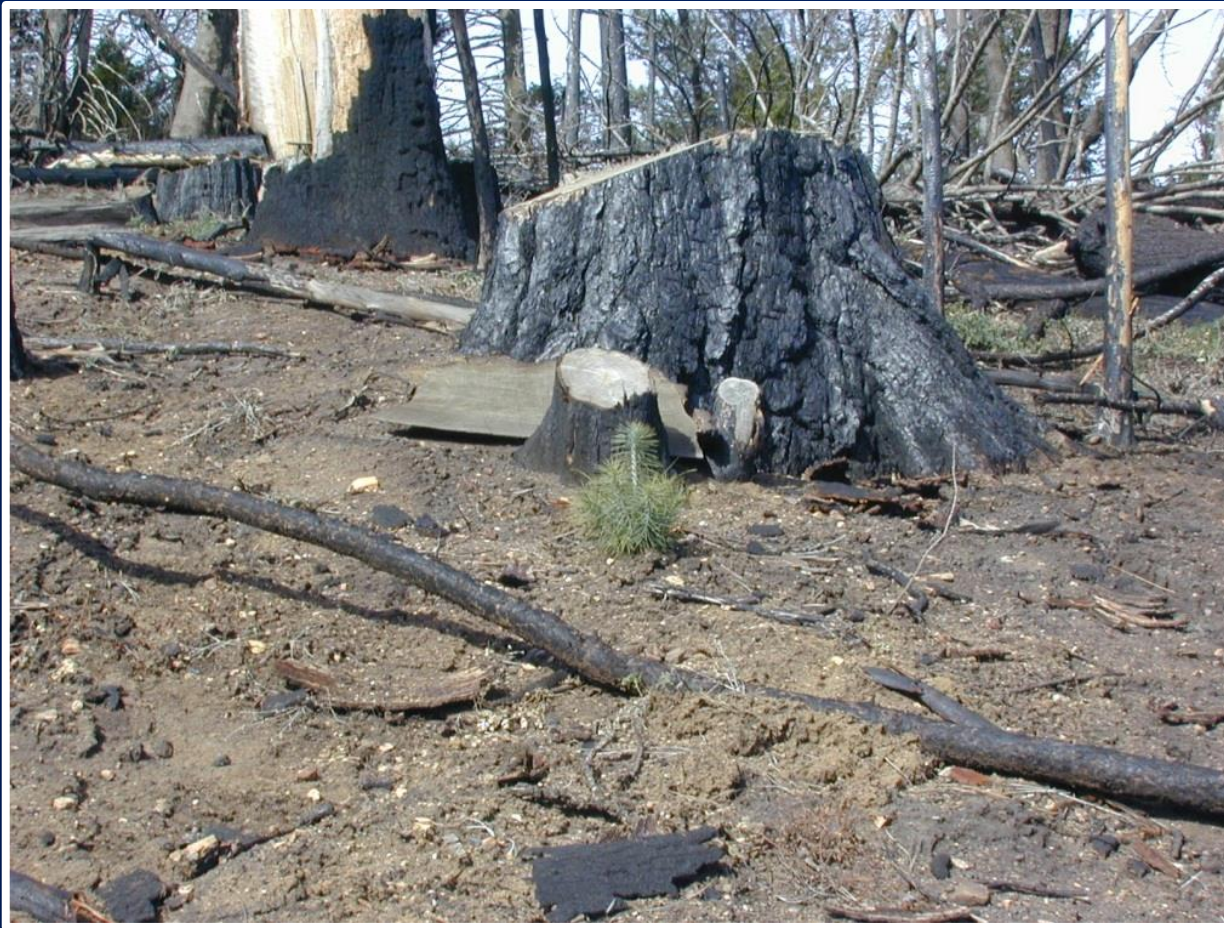
2002 Pines Fire, San Diego County

From 1980 to 2003 CFIP helped to pay for planting 51,391 acres, but over the last 10 years CFIP has planted less than 3,000 acres