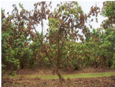
Dead avocado from Laurel Wilt Disease in Florida

This new complex also affects avocado and does so in a much more rapid and lethal fashion than PSHB. Five University of Florida researchers came to our area to talk about the problem and how they are dealing with it – what to look for and how to treat the disease and its spread. The meetings were attended by 45 growers from this area.