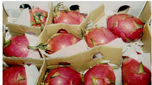
Packed Pitahaya fruit, a.k.a. Dragon Fruit

Ongoing research includes studies on pitahaya as an alternative perennial crop and various avocado and citrus production improvement studies, such as Asian Citrus Psyllid control, snail control and rootstock selection.