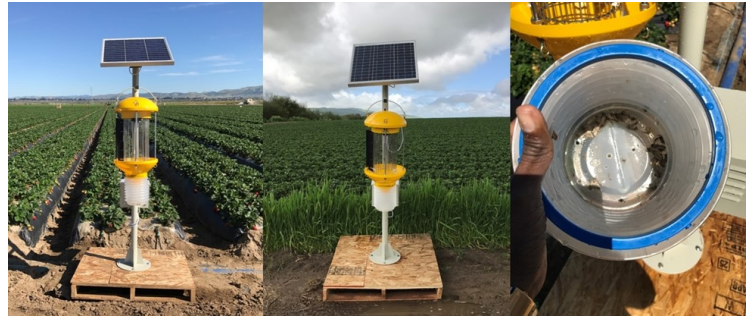
Solar-powered UV light trap being tested for strawberry pest management.