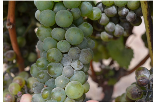
Powdery mildew infecting Chardonnay grapes in Santa Barbara County