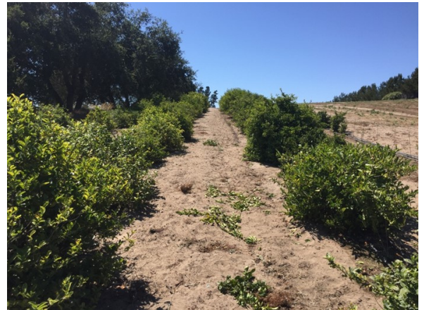
Established tea plantings at Forbidden Fruit Orchard (Lompoc, CA) which served as training for meeting participants as part of the tea agritourism grower meeting on August 9, 2017.