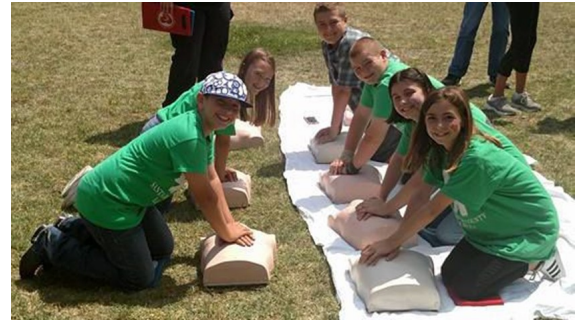
Members of the La Graciosa 4-H Club took a break from helping at the Family Day in the Park 4-H Agua Pura booth to participate in a CPR demonstration.