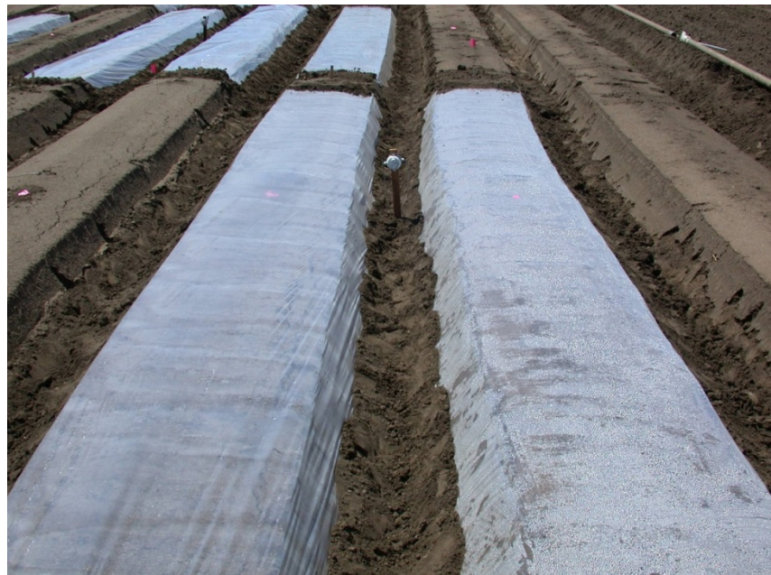
Figure 1. Soil solarization with clear polyethylene tarp prior to planting strawberry.

Solarization kills weed seed by exposure to heat for a critical period of time, which is why treatment is required for 4 to 8 weeks – to ensure that the soil temperature reaches critical soil temperatures and durations needed to kill weed seed, especially several inches below the soil surface. Moisture helps by holding heat in the soil and by germinating seed so that they are easier to kill with solarization. Dormant seed are also killed, but they