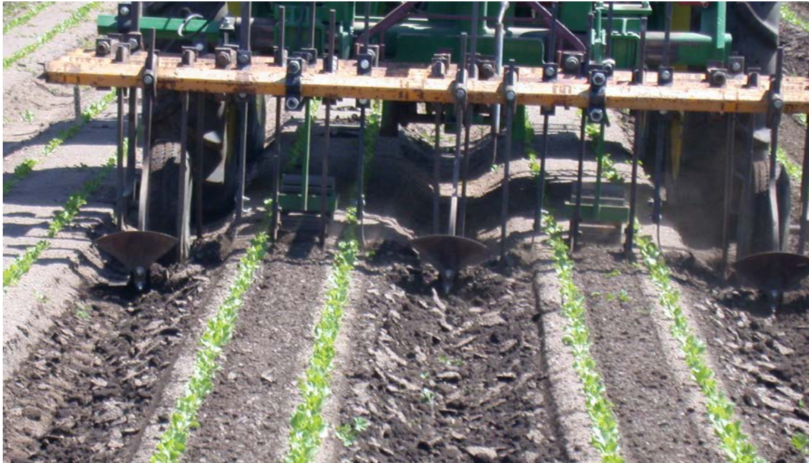
Figure 3. Row-crop cultivators may include combinations of bed knives, rolling baskets and duckfoot sweeps.

Sled-mounted cultivators can give very accurate control in row plantings. Sleds require more tractor power to pull than gauge-wheel cultivators but provide greater precision for vegetable row-crop production. Guide wheels (cone wheels, rubber guide wheels, etc.) also can improve the precision of cultivations if set up properly (fig. 3). Sled cultivators are generally rear-mounted on the tractor. Cultivators can also be set up on tool bars mounted between front and rear wheels of a row crop tractor with an off-center driver seat and steering column to allow for easy viewing by the operator.