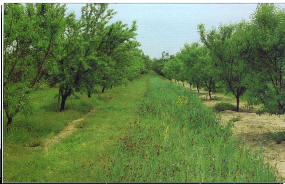
At the almond orchard site, lacewings, syrphid flies and parasitic wasps moved up to 100 feet away from the insectary plantings.

sectary plants. The insects obtained the label through feeding on Rb-rich nectar and pollen sources that concentrated in the plant. Because Rb occurs naturally in plant and insect tissues at fairly low and uniform levels, relatively small increases in Rb result in a measurable label at levels above the natural background concentration normally found in insects (Berry et al. 1972).