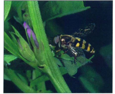
Scientists found that 70% of the syrphid flies in almond trees were marked with rubidium 100 feet away from the insectary planting.

sects that are using the insectary plants. Our laboratory studies showed that green lacewings need to feed on Rb-marked floral resources for up to 24 hours to acquire detectable levels of Rb. If beneficial insects are feeding on both marked and unmarked plants in the field, the impact of the Rb label will likely be diluted. For example, at Hedgerow Farms, where we had low levels of labeling, there is an abundance of floral resources other than