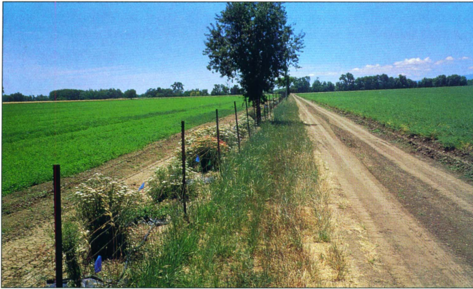
Hedgerow of insectary shrubs and native grasses, Yolo County.