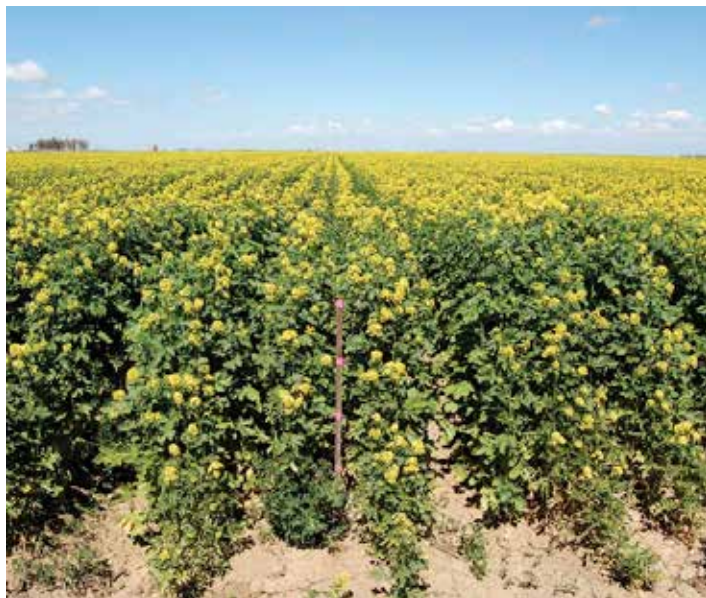
Plants in the mustard family ( Brassicaceae ) are used to reclaim polluted soils.

And what can be done with the plants after they have done their work? The plants cannot be plowed back into the soil, consumed by humans or animals, or put into a landfill—but they can be burned. Work is being done on the extraction of metals from these hyperaccumulator plants. This process is called phytomining and involves the smelting of metals from the plants. In other words, the metals found in the plant tissues may be harvested and used commercially by the mining industry. Research today is also working on genetically engineered super-hyperaccumulator plants to accomplish toxic “mining” with increased speed and volume. With proper guidelines and regulations from the EPA, phytoremediation may play a growing role in the push to a cleaner, greener world.