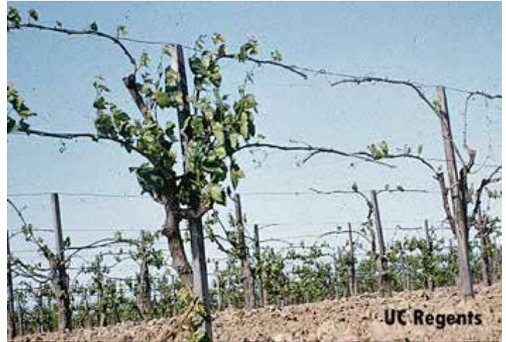
In winters of inadequate chilling, a PGR is used to break dormancy of grape buds.

In California, according to the Department of Pesticide Regulations, PGR and pesticide use is strictly controlled. Growers apply low level PGRs to achieve a sought after purpose, such as increasing insect and disease resistance, preventing premature fruit drop in oranges or increasing root or stem strength. In addition, PGRs are applied to slow growth or keep young plants compact for easier transplantation from plant nurseries to the home grower. The shorter plants are not easily tangled, bent or damaged in transportation.