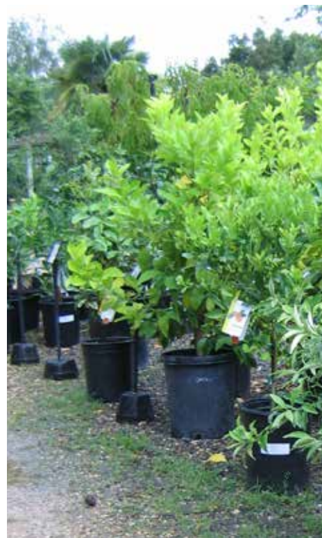
Research shows adding vitamin B1 does not reduce transplant shock.