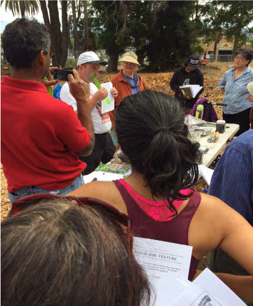
Caption: Workshop at the Gill Tract

Supported by County Agriculture Departments!