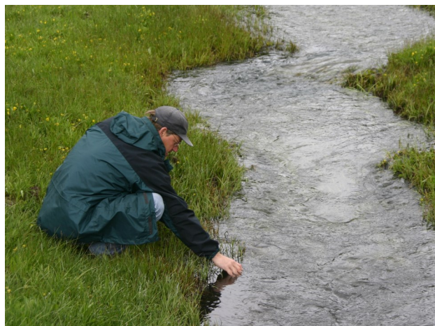
Sampling water from Grizzly Valley Allotment

UC Davis and UC Cooperative Extension researchers have worked with the US Forest Service and stakeholders on multiple studies to 1) quantify microbial pollution in surface waters; 2) compare results to regulatory benchmarks; and 3) examine relationships between water quality, environmental conditions, and multiple uses (e.g., grazing, recreation).