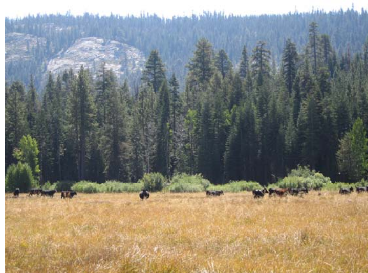
Cattle grazing a mountain meadow on the Plumas National Forest.