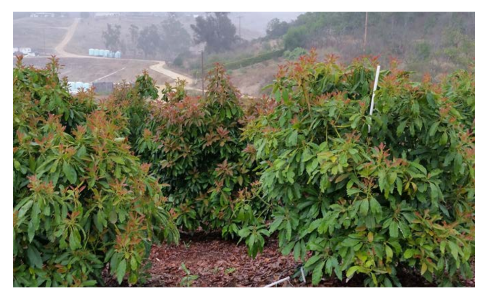
Figure 1. (10' x10' spacing) of 72 trees of Hass and Lamb Hass avocados were planted in Valley Center, CA in August 2012. Also a pollinizer Zutano tree was planted for every 8 Hass trees.

We estimated the costs of water and pruning for the experiment and compared them with the costs of the conventional practices we developed in 2011 (adjusted for inflation). We compared the costs on a cost of a unit of production, i.e. cost per lb. of yield (Table 1).