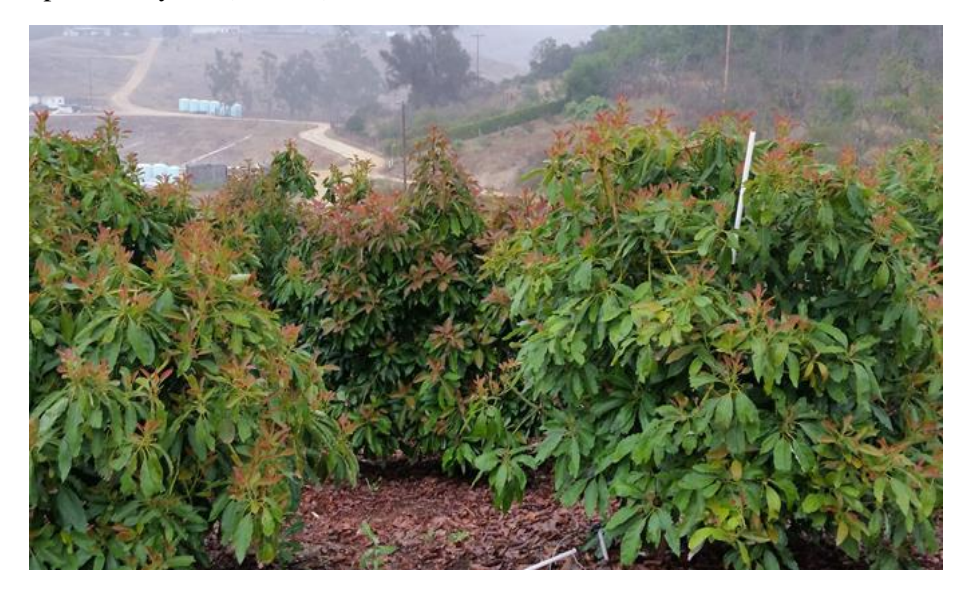
Figure 1. (10' x10' spacing) of 72 trees of Hass and Lamb Hass avocados were planted in Valley Center, CA in August 2012. Also a pollinizer Zutano tree was planted for every 8 Hass trees.

We estimated the costs of water and pruning for the experiment and compared them with the costs of the conventional practices we developed in 2011 (adjusted for inflation). We compared the costs on a cost of a unit of production, i.e. cost per lb. of yield (Table 1).