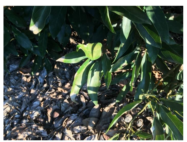
Paraquat Leaf Damage. B.Faber