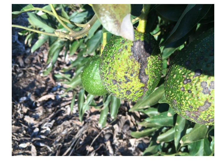
Paraquat Fruit Damage. B. Faber