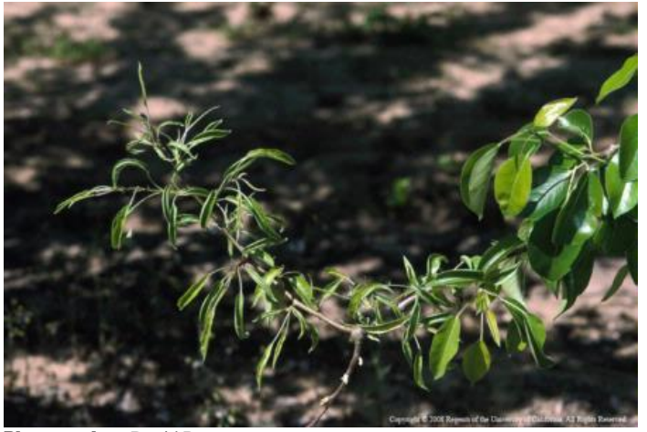
Glyphosate Damage