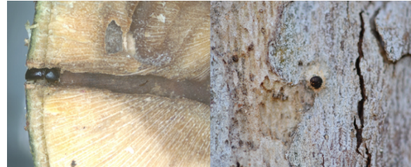
Figure 2: Shows a female shot-hole borer blocking the entry hole with her abdomen (A) and in cross section (B).

affected trees which too often result in complete removal of infested trees.