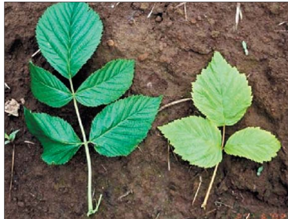
Figure 1.—Nitrogen-sufficient red raspberry (left) and nitrogen-deficient red raspberry (right).

Caneberry plants require chemical elements from air, water, and soil to ensure adequate vegetative growth and fruit production. When levels of these nutrients in the plant are low, growth and yield may be affected. Severely reduced nutrient supply can lead to visible nutrient deficiency symptoms such as leaf discoloration and distortion (Figures 1 and 2). Routine collection and analysis of tissue