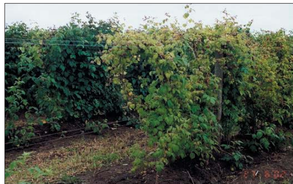
Figure 2.—Nitrogen-sufficient red raspberry (left) and nitrogen-deficient red raspberry (right).