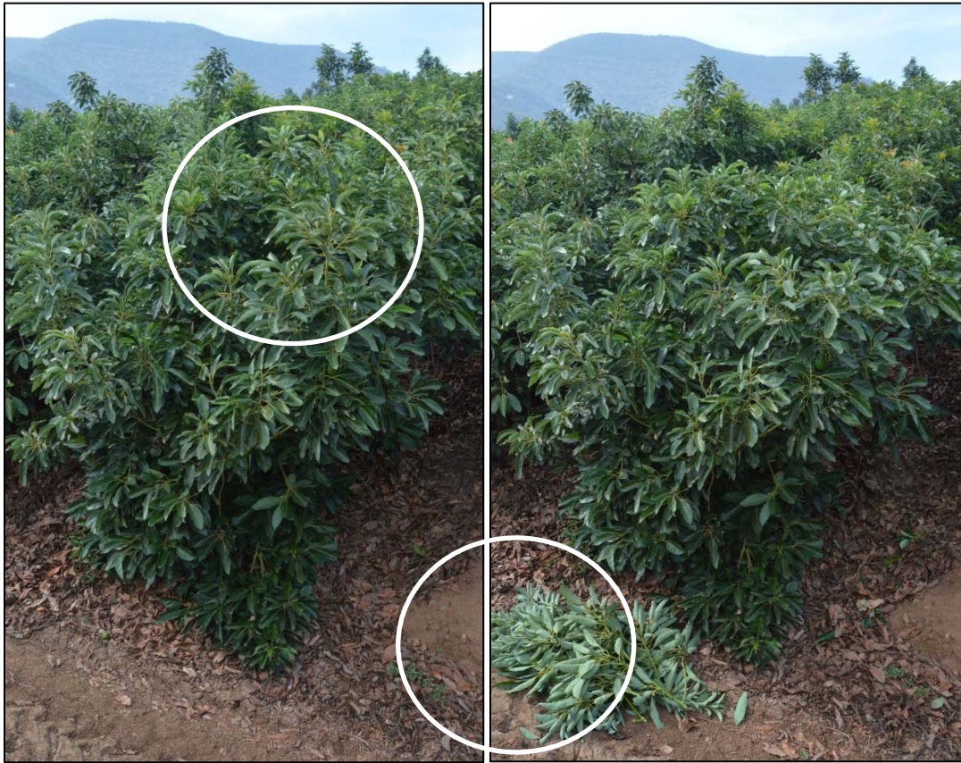
Figure 3. Post-harvest hand pruning of lateral shoot in a HDP orchard (Mexicola x Hass; 7.5x7.5; 700 hundred trees per acre) to keep tree height under control and limit shading effect.