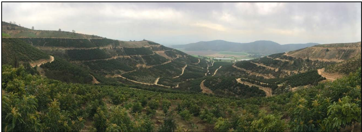
Figure 1. An example of high-density planting of avocado production in Chile.

This article originally appeared in California Avocado Commission's "From the Grove, Fall 2016" edition.