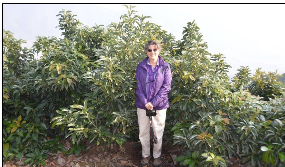
Figure 2. Ultra High Density Planting (4x4; 2700 trees per acre) in a Chilean orchard (Mexicola x Hass) planted in 2013. Look how crowded, compact and shorts the trees are next ML Arpaia. Production in 2015 was 17,000 lbs. per acre.