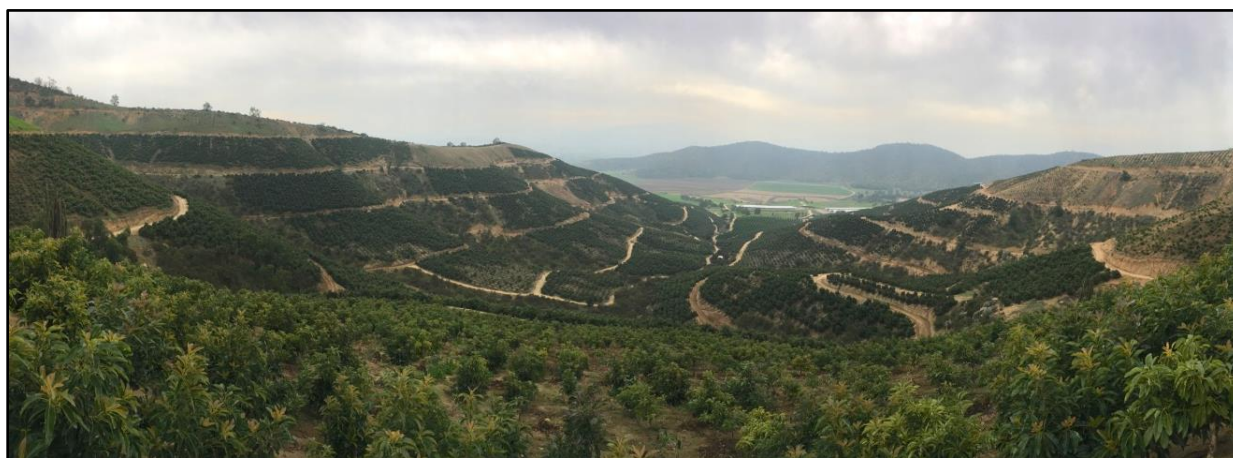
Figure 1. An example of high-density planting of avocado production in Chile.

This article originally appeared in California Avocado Commission's "From the Grove, Fall 2016" edition.