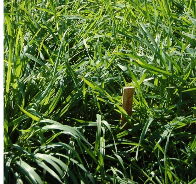
Wheat (Yamhill) 120 days after planting, Lockeford PMC.