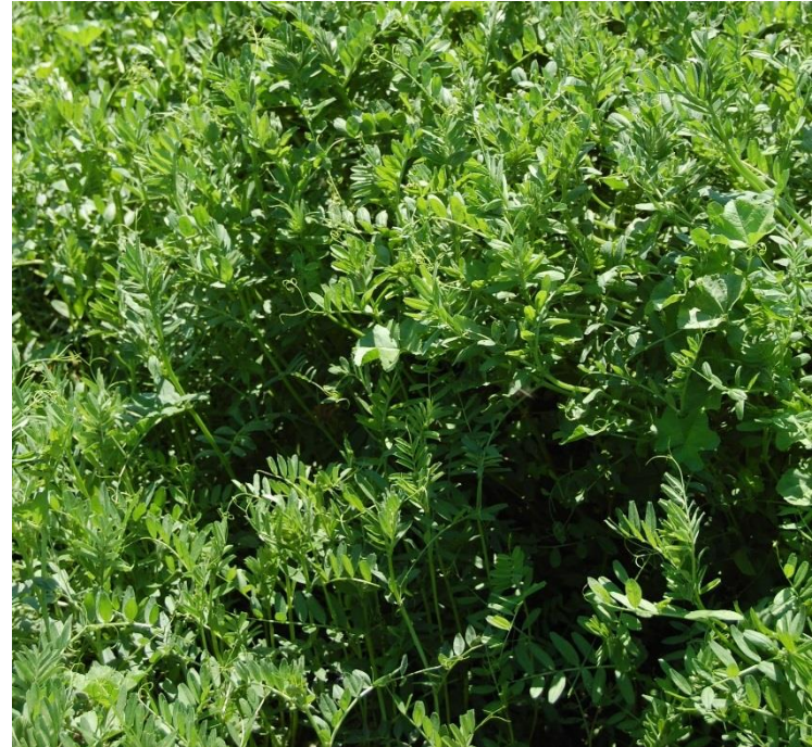
Common vetch, 165 days after planting, Lockeford PMC.