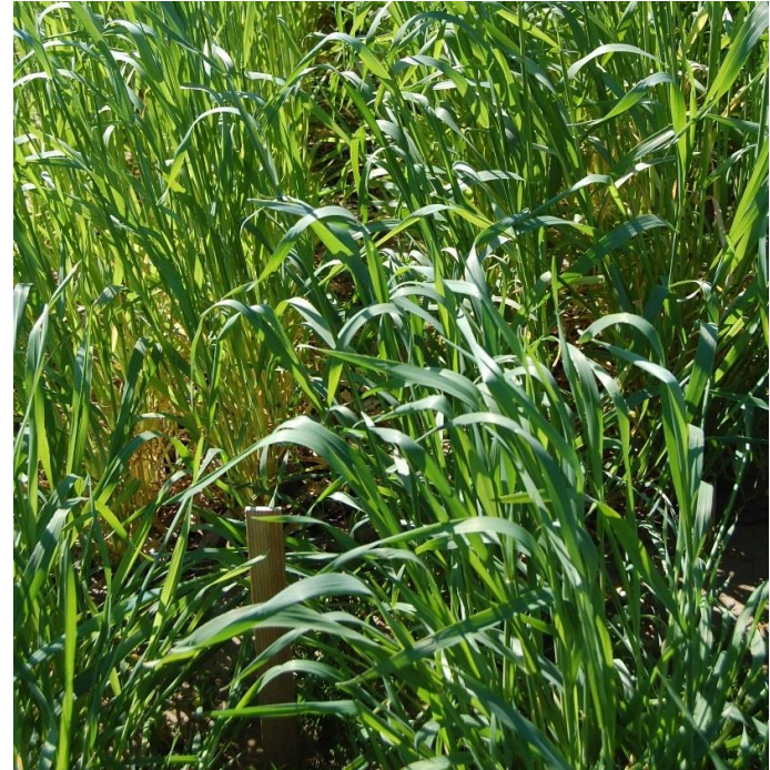
Cereal rye (Merced) 120 days after planting, Lockeford PMC.