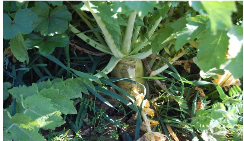
Mature radish plant showing large tap root, Lockeford PMC.