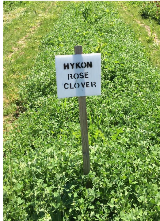
Rose clover, Lockeford PMC.