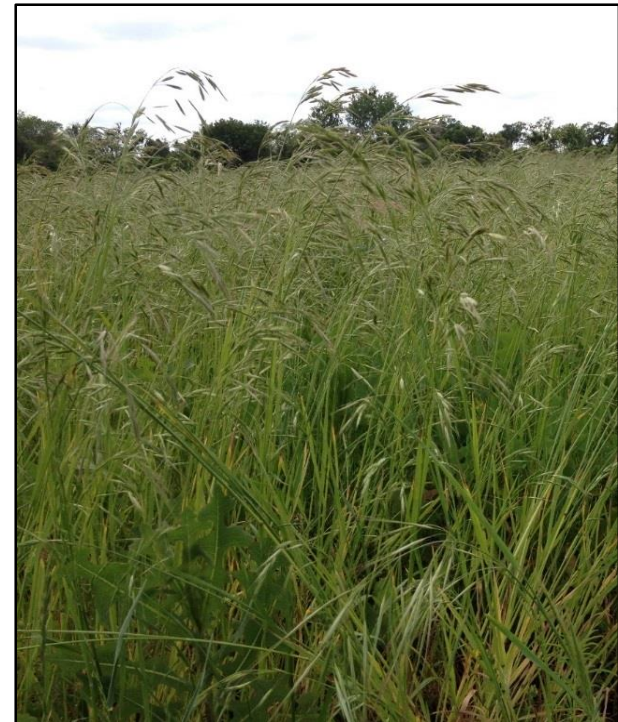
'Cucamonga' California brome, Lockeford PMC.

Note: California brome is generally perennial.