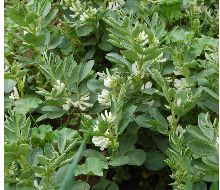
Bell bean, Lockeford PMC.