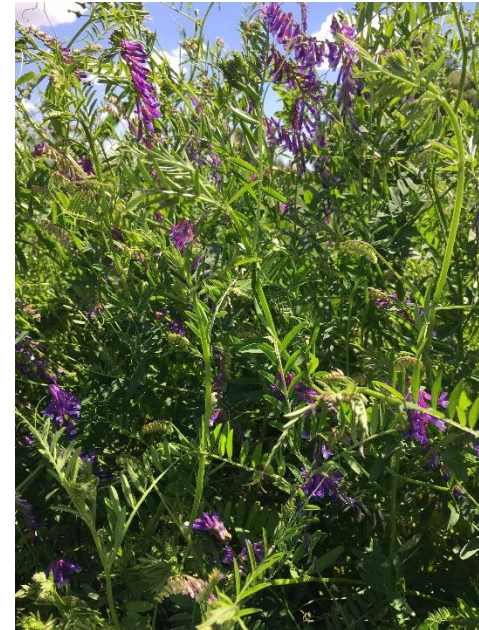
Woollypod vetch (Lana), Lockeford PMC.