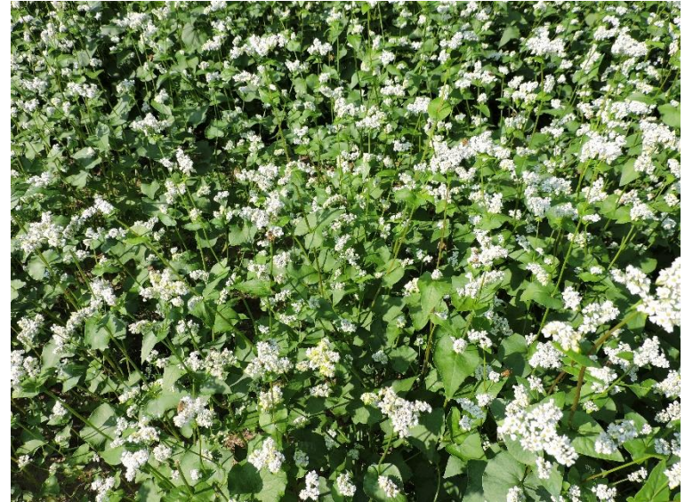
Buckwheat, Lockeford PMC.