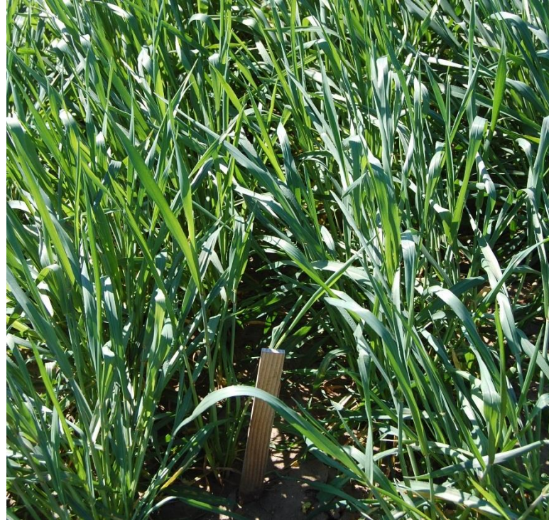
Triticale (Juan) 120 days after planting, Lockeford PMC.