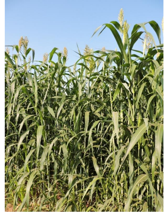
Sorghum, Lockeford PMC.