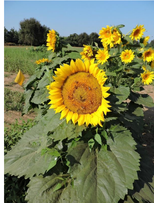
Sunflower (black), Lockeford PMC.

Pest Alert: See UC IPM Website for most recent info.