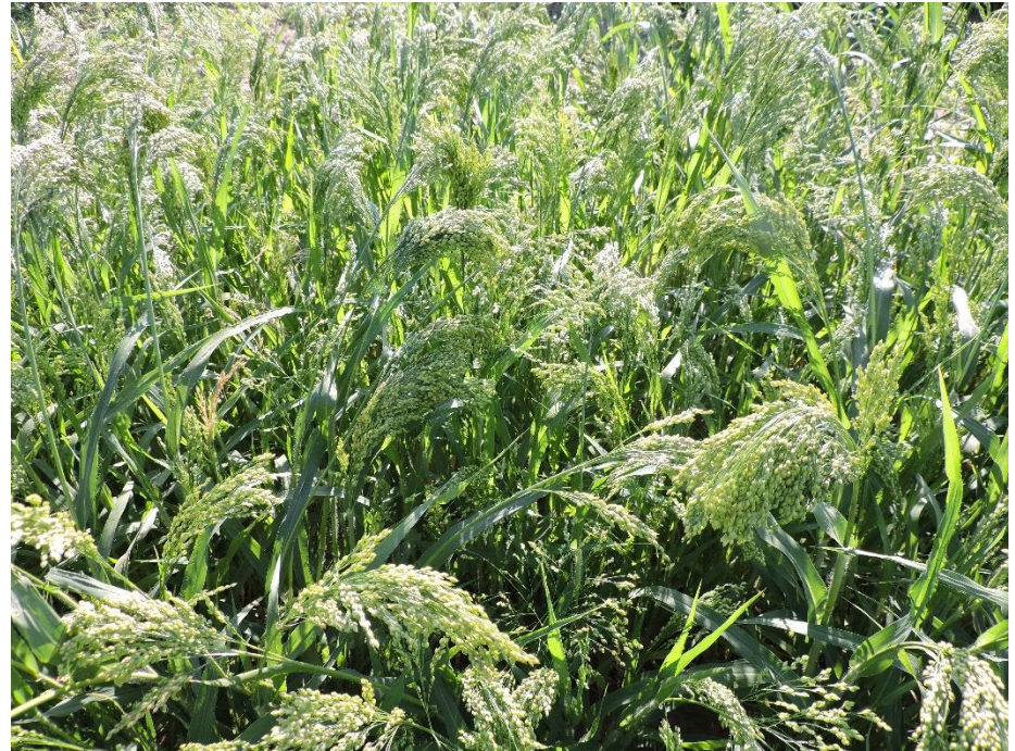
Proso millet, Lockeford PMC.