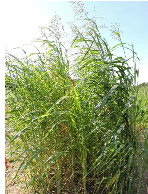
Sudangrass (Piper), Lockeford PMC.