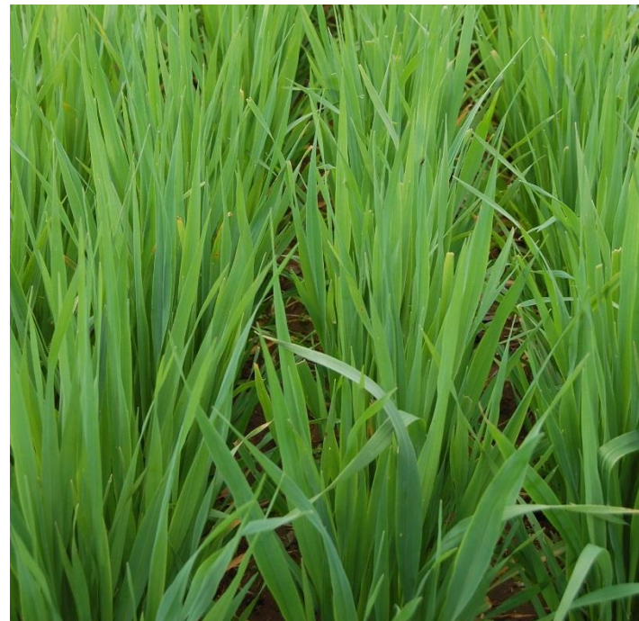
Oats (Cayuse) 120 days after planting, Lockeford PMC.