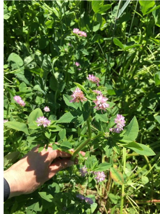
Persian clover (Lightning), Lockeford PMC.