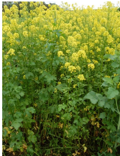
Common mustard, Lockeford PMC.