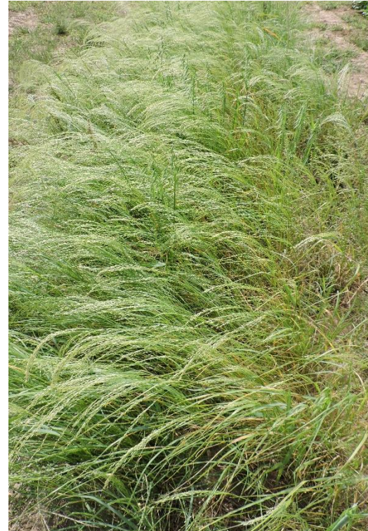
Teff (Excalibur), Lockeford PMC.