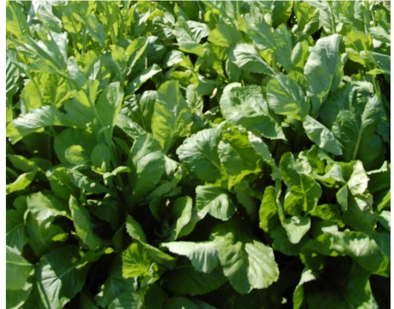
Oriental mustard, Lockeford PMC.