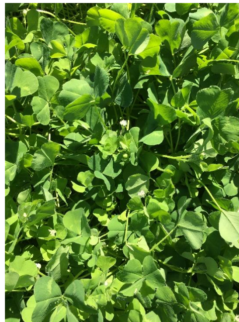
Subterranean clover (Antas), Lockeford PMC.