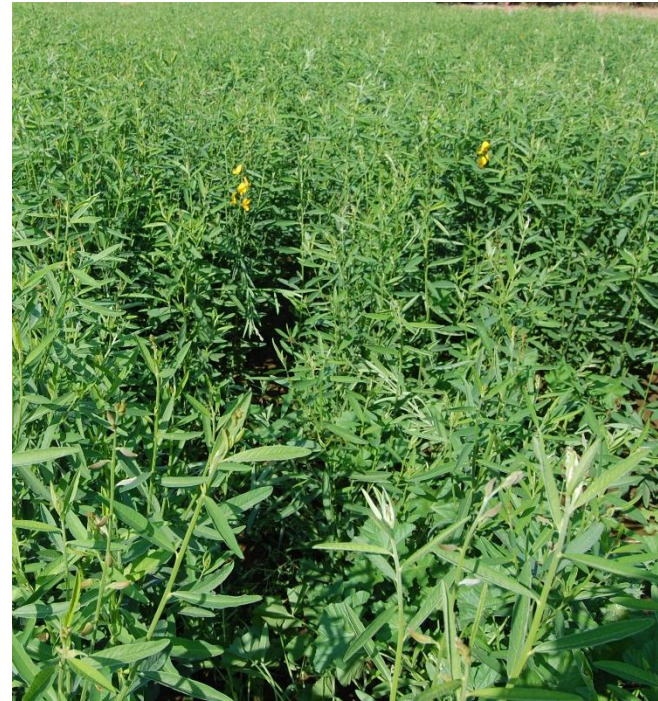
Sunnhemp (Tropic Sun), Lockeford PMC.