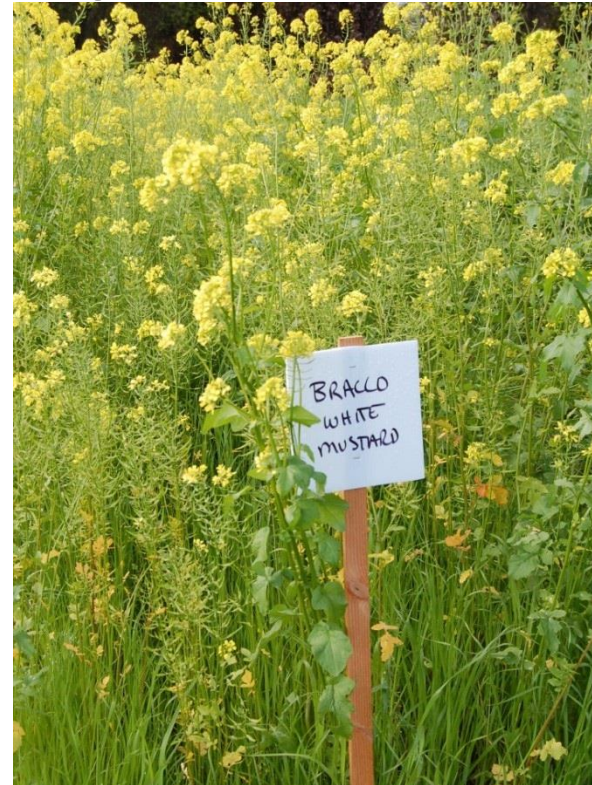
White Mustard (Bracco), Lockeford PMC.