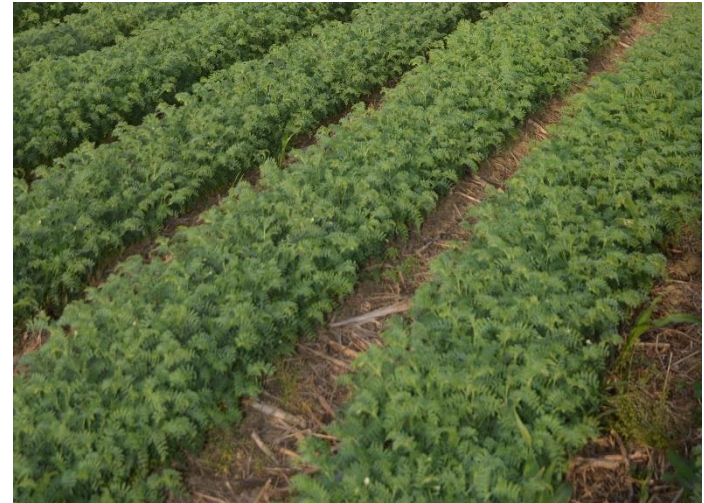
Chickpea, planted as no-till cover crop at UC West Side Agricultural Research and Extension Center.

http://www.agmrc.org/media/cms/ec183_435DBB048F8C5.pdf