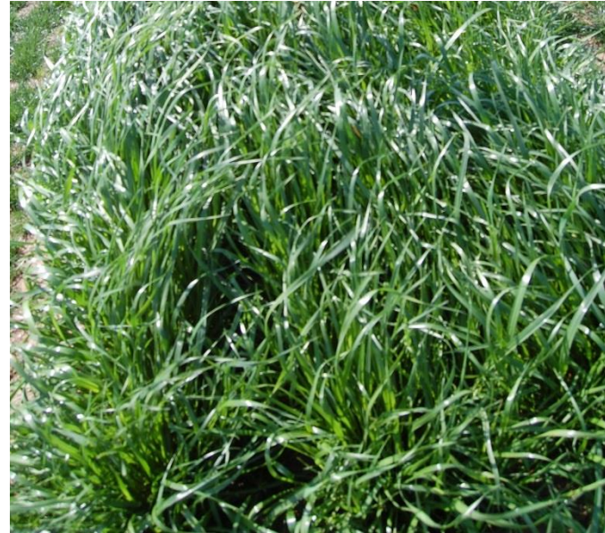
Common annual ryegrass, Lockeford PMC.