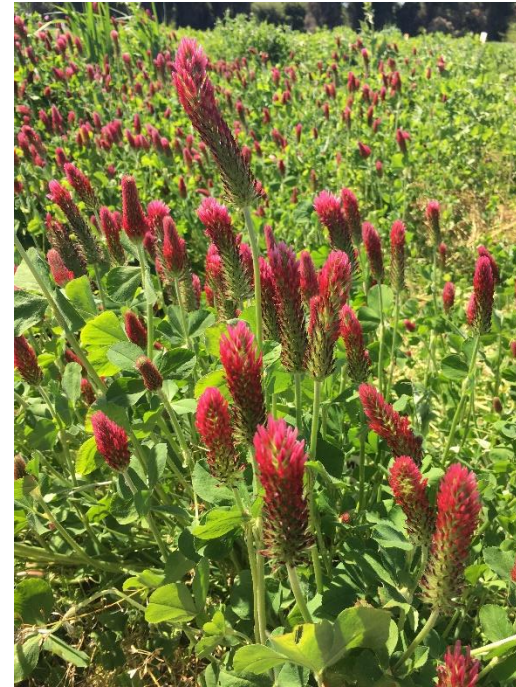
Crimson clover, Lockeford PMC.