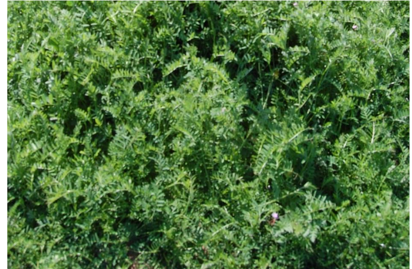
Hairy vetch, Lockeford PMC.