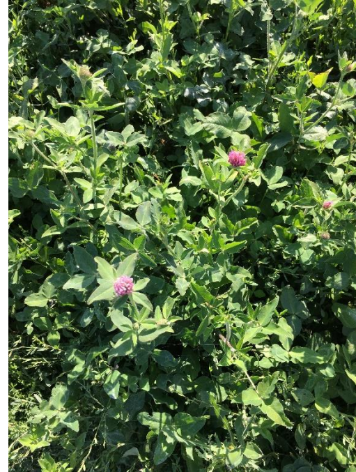
Red clover, Lockeford PMC.

https://plants.usda.gov/plantguide/pdf/pg_trpr2.pdf http://covercrops.cals.cornell.edu