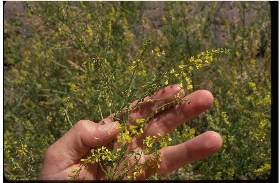
Sweetclover SARE – Agriculture Sustainability Institute at UC Davis, CA.