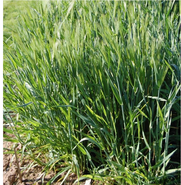
Barley (UC 937) 150 days after planting, Lockeford PMC.