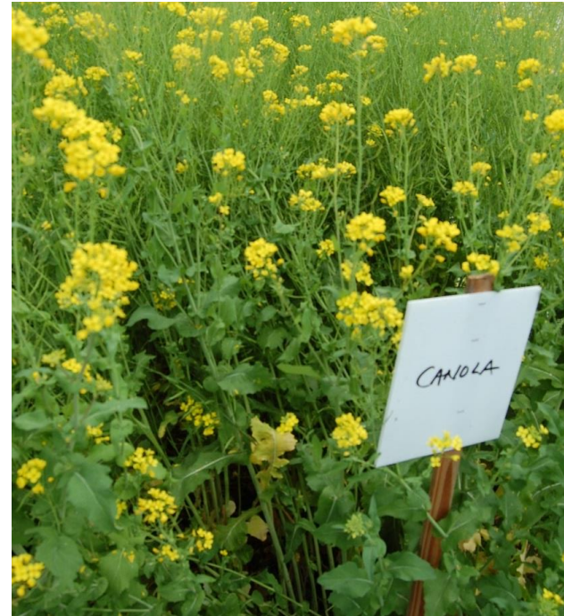
Canola at Lockeford PMC.