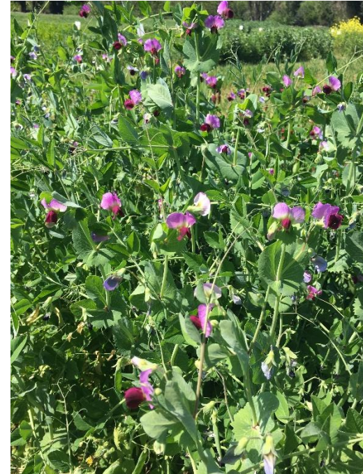
Field pea (Dundale), Lockeford PMC.