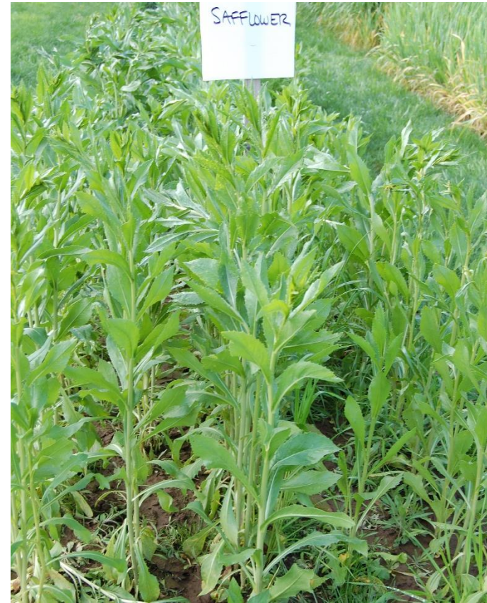
Safflower, Lockeford PMC.