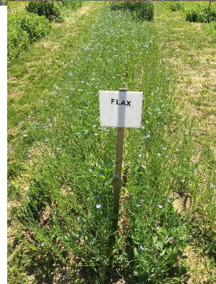
Flax, Lockeford PMC.