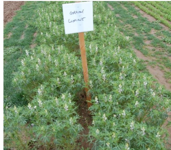
Grain Lupine Lockeford PMC.