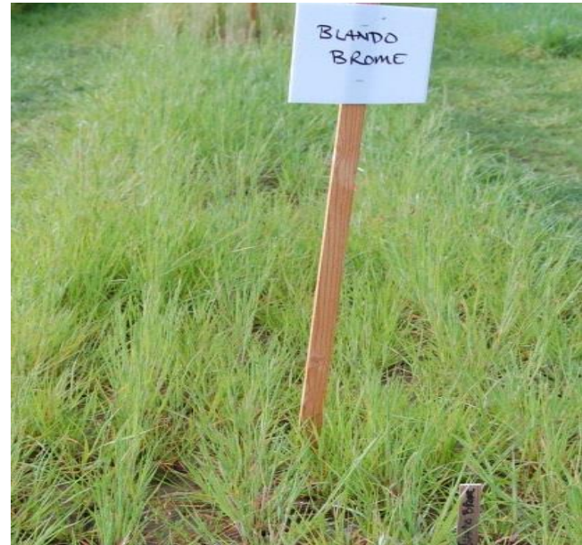
'Blando' soft brome, Lockeford PMC.