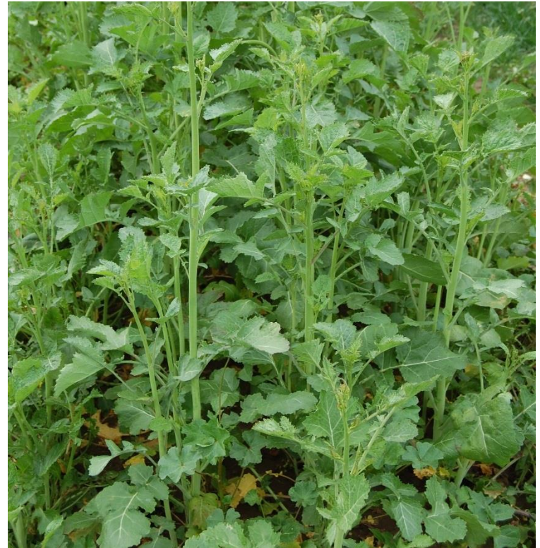
Brown mustard (Nemfix) 135 days after planting, Lockeford PMC.