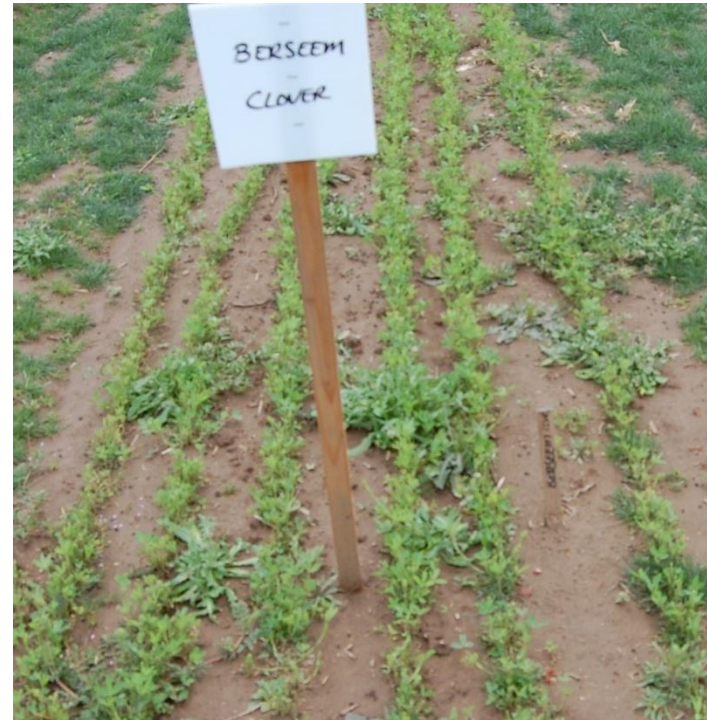
Berseem clover, Lockeford PMC.