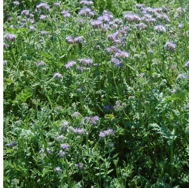
Lacy Phacelia, Lockeford PMC.

Lacy phacelia - Phacelia tanacetifolia Benth.