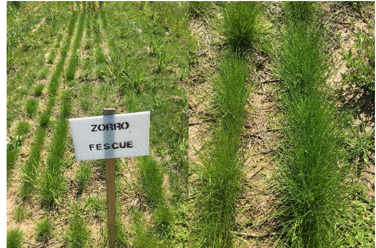
Annual fescue (Zorro), Lockeford PMC.