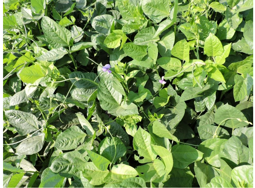
Cowpea (Red Ripper), at Lockeford PMC.