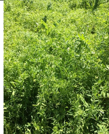
Lentil (Viceroy), Lockeford PMC.