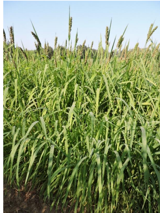
Japanese millet, Lockeford PMC.