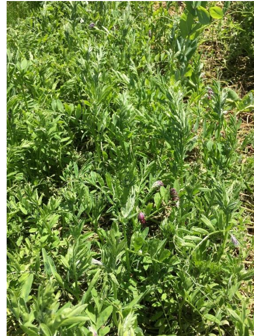
Purple vetch, Lockeford PMC.