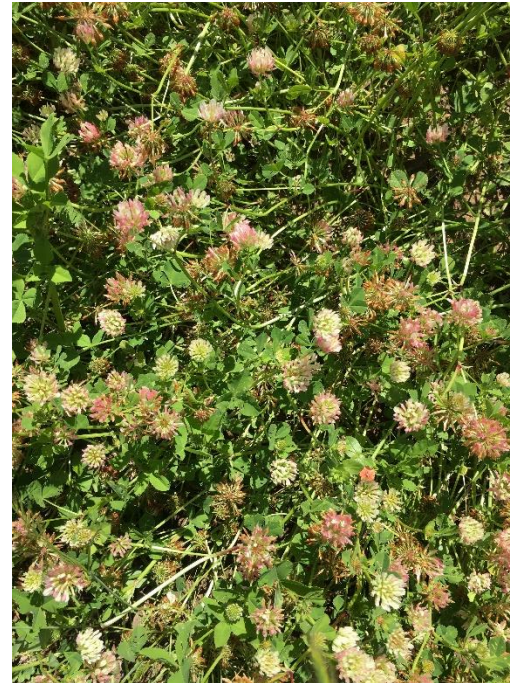
Balansa clover (Frontier), Lockeford PMC.