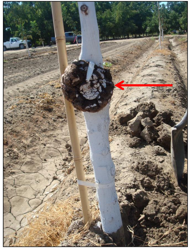
Figure 2. Crown gall above the graft union (A) and at the graft union (B). Red arrows indicate location of graft union.