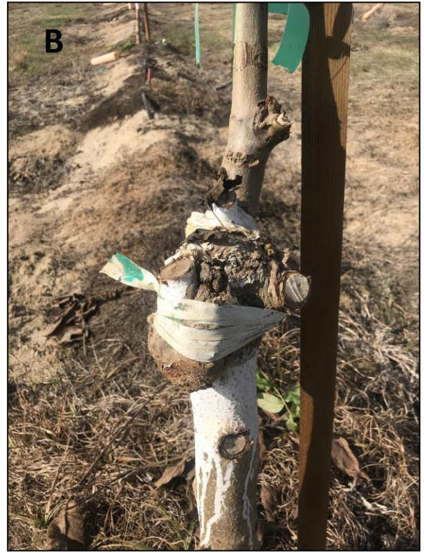
Figure 3. These clonal 'Paradox' rootstocks were planted in an orchard formerly containing crown gall-infected cherry. The trees were field grafted in the second leaf and exhibited excess suckering ( A ) on the rootstock. As these suckers were cut, loppers occasionally touched infested soil, suggesting that inoculum causing galls at the graft union ( B ) may have originated within the orchard.