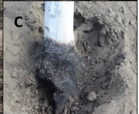
Figure 4. An air spade can be used to expose the crown of the tree prior to gall excision ( A ). The gall can be cut off ( B ) and the resulting wound may be cauterized by flaming with a propane torch. Excessive heat may be both unsightly, leaving charred tissue and resulting in damage to the cambium ( C ).