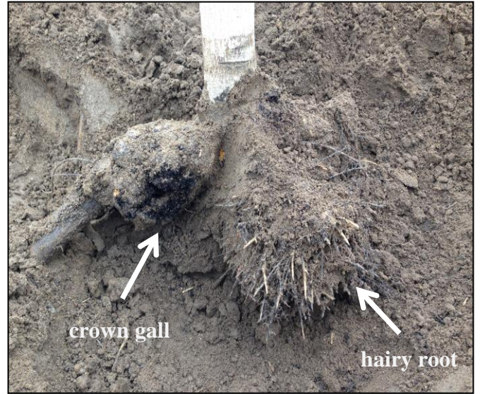
Figure 1. A) Crown gall at the crown of a 'Paradox' walnut rootstock; B) Tree affected by both crown gall and hairy root.