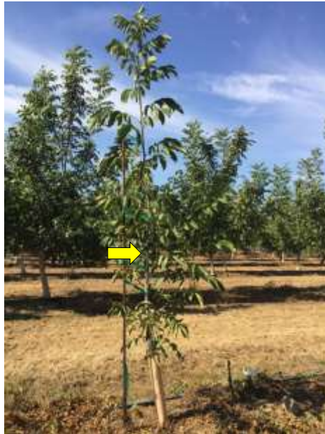
Photo 1. Unheaded nursery grafted Chandler on RX1 on October 10, 2018.

A 5-year study comparing different heading heights at planting using several varieties and rootstocks was conducted by UCCE Walnut Specialist Bruce Lampinen at UC Davis. He headed back trees to 3, 6, 9, or 12 buds at planting. After 1½ years and for the remaining 3 years, there were no significant differences in tree height between the treatments. On finished trees at planting, consider skipping the heading back step to save money, but not the painting step. For more information, visit sacvalleyorchards.com/walnuts/horticulture-walnuts/walnut-tree-training-different-nursery-products/