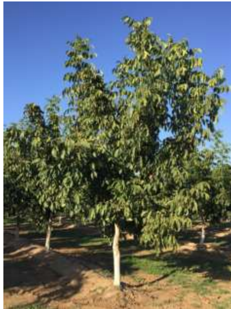
Photo 2. Unpruned/unheaded Solano on RX1 in Sutter County was mechanically harvested in 3 rd leaf.

If an insect growth regulator insecticide was used for scale within the last two years, monitoring may indicate that a spray is not needed this year. See the article by Emily Symmes on pest management updates in this issue.