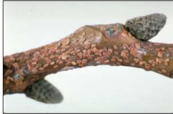
Photo 4. Healthy (non-parasitized) frosted scale nymphs.