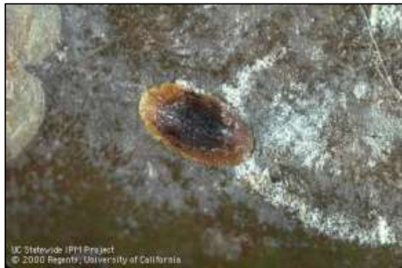
Photo 5. Parasitized frosted scale nymph.

Navel orangeworm. In general, 2018 seems to have seen less harvest damage caused by navel orangeworm in California nut crops relative to 2017. Following the high damage year, nut crop growers throughout the state took more aggressive approaches to managing NOW, including more intensive sanitation efforts, increased adoption of mating disruption, and in some cases, additional in-season insecticide treatments. Growers who embraced this multi-tactic IPM strategy saw the best improvements to harvest damage. However, NOW remains a formidable pest with the potential to cause severe damage and losses in economic returns if growers do not remain vigilant.