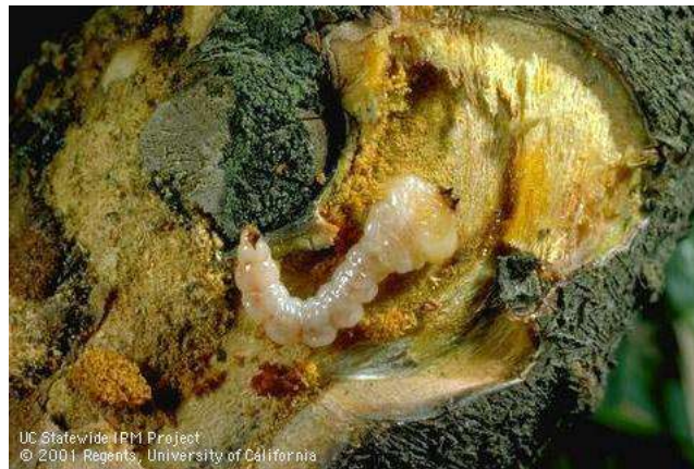
Photo 6. Pacific flatheaded borer larva.