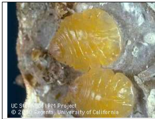
Photo 1. Live walnut scale adults.