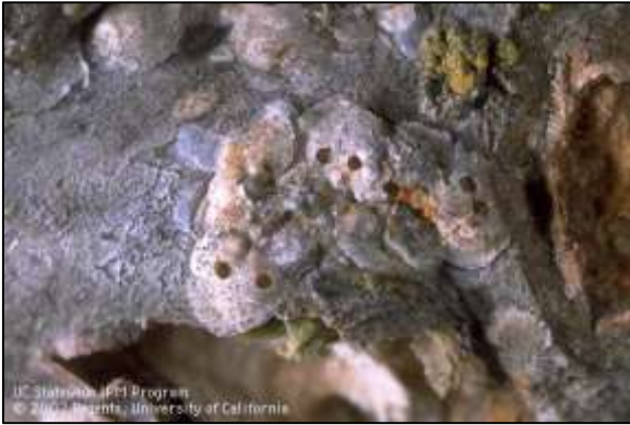
Photo 3. Parasitized walnut scale adult.