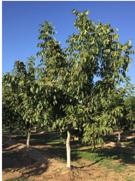
Photo 2. Unpruned/unheaded Solano on RX1 in Sutter County was mechanically harvested in 3rd leaf.

If an insect growth regulator insecticide was used for scale within the last two years, monitoring may indicate that a spray is not needed this year. See the article by Emily Symmes on pest management updates in this issue.