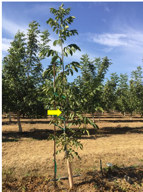
Photo 1. Unheaded nursery grafted Chandler on RX1 on October 10, 2018. Yellow arrow indicates unheaded height at planting in February 2018.

A 5-year study comparing different heading heights at planting using several varieties and rootstocks was conducted by UCCE Walnut Specialist Bruce Lampinen at UC Davis. He headed back trees to 3, 6, 9, or 12 buds at planting. After 1½ years and for the remaining 3 years, there were no significant differences in tree height between the treatments. On finished trees at planting, consider skipping the heading back step to save money, but not the painting step. For more information, visit sacvalleyorchards.com/walnuts/horticulture-walnuts/walnut-tree-training-different-nursery-products/