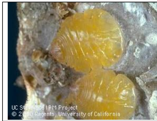
Photo 1. Live walnut scale adults.