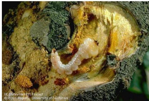
Photo 6. Pacific flatheaded borer larva.