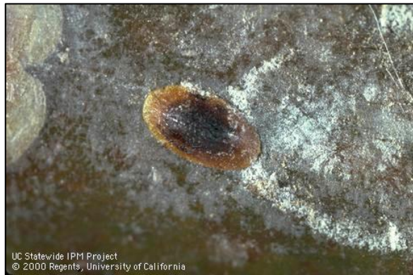
Photo 5. Parasitized frosted scale nymph.

Navel orangeworm. In general, 2018 seems to have seen less harvest damage caused by navel orangeworm in California nut crops relative to 2017. Following the high damage year, nut crop growers throughout the state took more aggressive approaches to managing NOW, including more intensive sanitation efforts, increased adoption of mating disruption, and in some cases, additional in-season insecticide treatments. Growers who embraced this multi-tactic IPM strategy saw the best improvements to harvest damage. However, NOW remains a formidable pest with the potential to cause severe damage and losses in economic returns if growers do not remain vigilant.