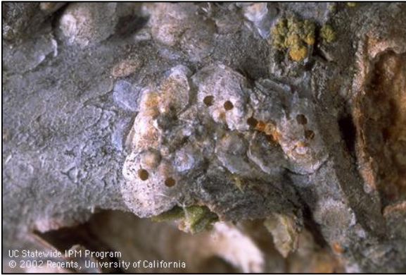
Photo 3. Parasitized walnut scale adult.